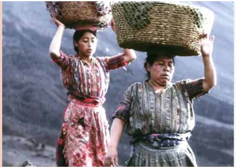
IXCANUL, Jan. 6-12