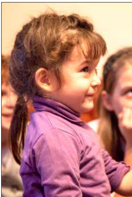
TO THE MOON AND BACK, Jan. 22, 23