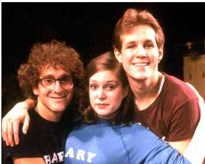
BEST WORST THING THAT EVER COULD HAVE HAPPENED... Jan. 13, 15, 19