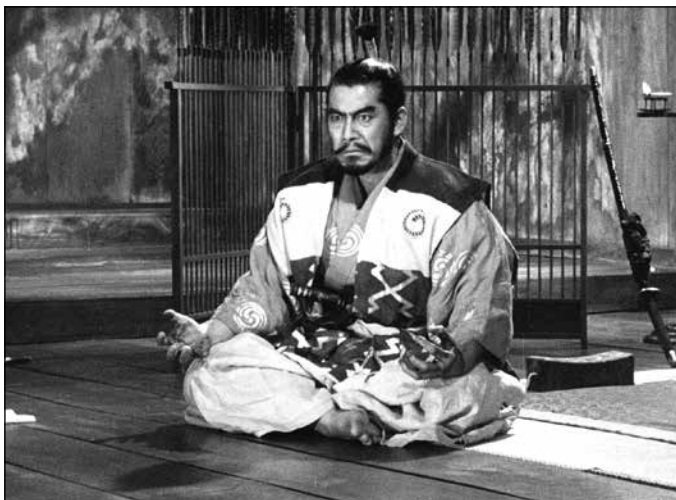
THRONE OF BLOOD, Jan. 7, 12