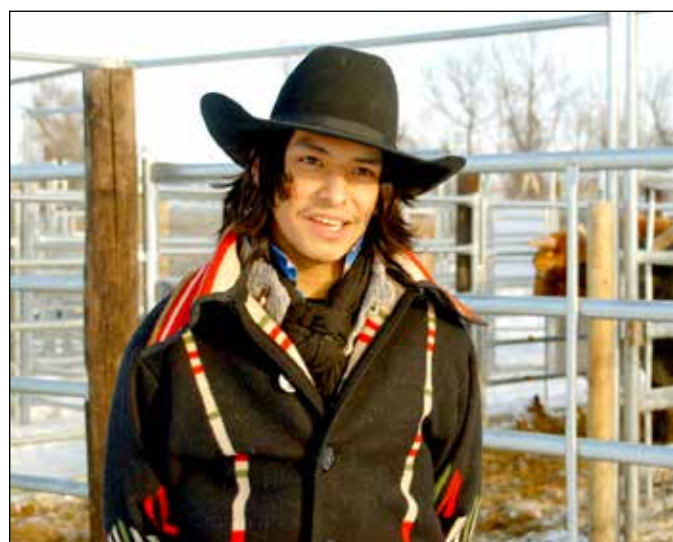
LITTLE WOUND'S WARRIORS , Jan. 21