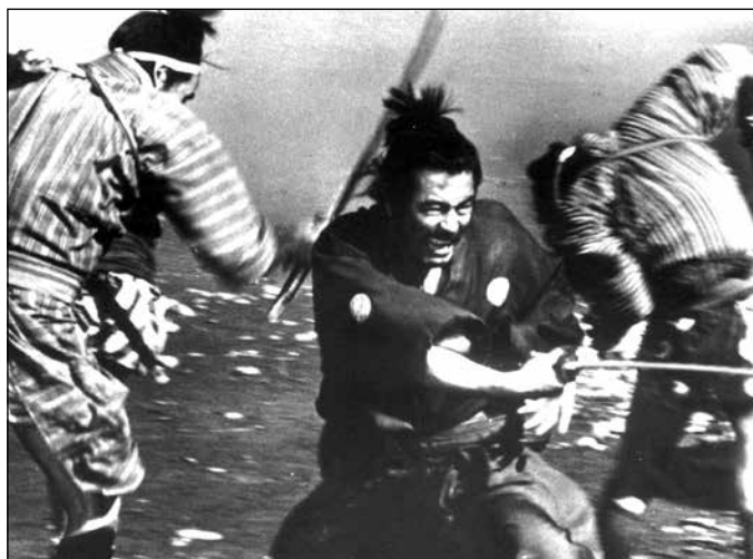
YOJIMBO, Jan. 21, 24