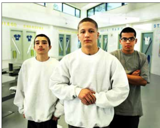
THEY CALL US MONSTERS , Jan. 20, 25