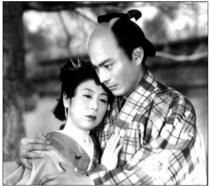
THE LIFE OF OHARU, Jan. 28, Feb. 2

RASHOMON was the film that opened Western eyes to Asian cinema. Set in medieval Japan, it presents an apparent rape and murder from four different points of view, all of which contradict each other. In Japanese with English subtitles. DCP digital. (MR)