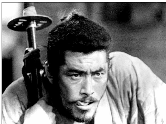
SEVEN SAMURAI, Jan. 14, 16, 18