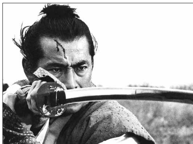
SAMURAI REBELLION, Jan. 21, 26