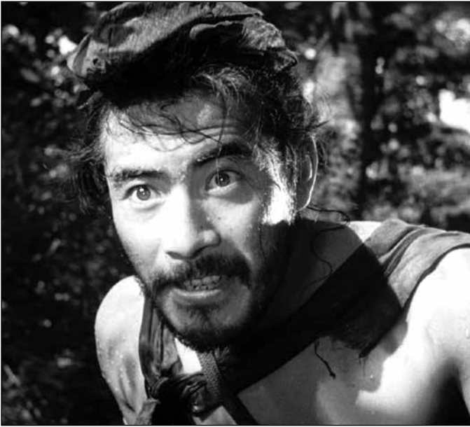
RASHOMON, Jan. 28, 30