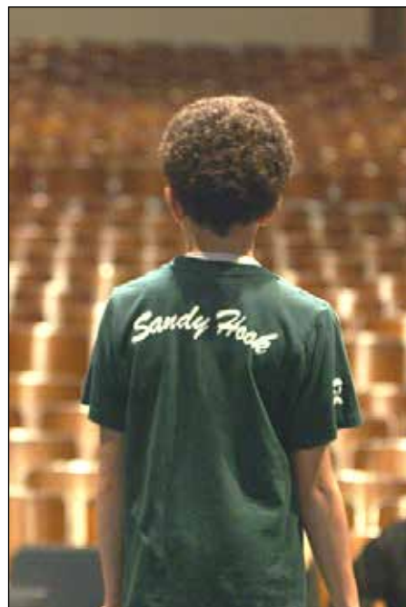
MIDSUMMER IN NEWTOWN, Jan. 29, Feb. 2