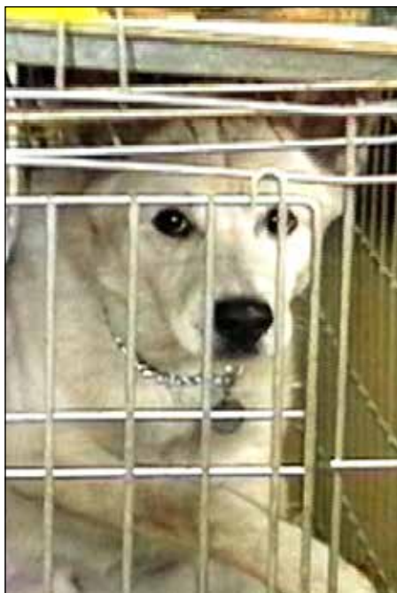
WE ARE ONE, Jan. 27, Feb. 1