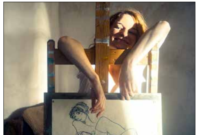
EGON SCHIELE: DEATH AND THE MAIDEN (Austria)