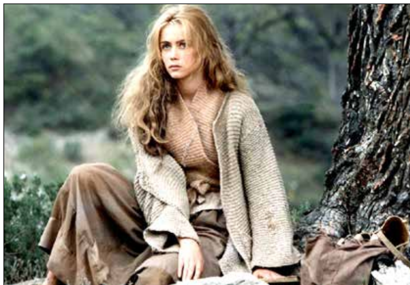
MANON OF THE SPRING , Feb. 24, 25, March 1