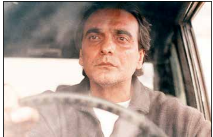
TASTE OF CHERRY, Feb. 17, 18, 19