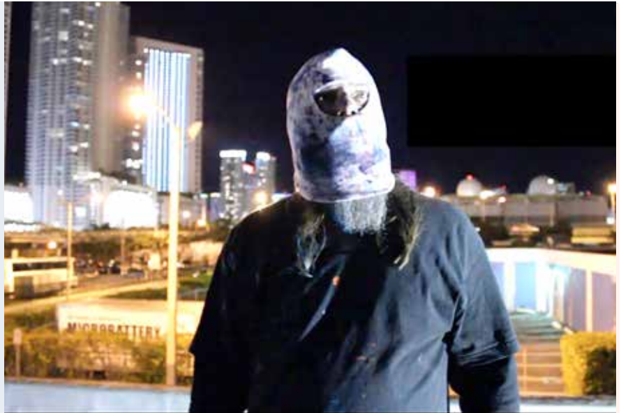
SAVING BANKSY, Feb. 3-9