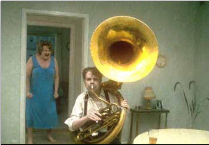
YOU, THE LIVING, March 28