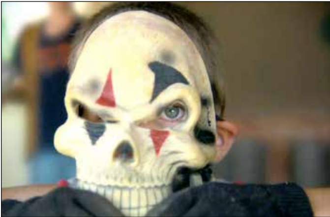
BOMBAY BEACH, Feb. 7