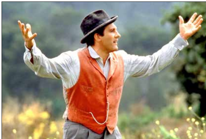
JEAN DE FLORETTE , Feb. 24, 25, 27

MANON OF THE SPRING takes up the story some ten years later, with grown-up Manon (Béart), wild and beautiful, now one of the central characters. This second part is a tale of revenge, revelation, and cosmic payback about which it is best not to reveal too much. (MR)