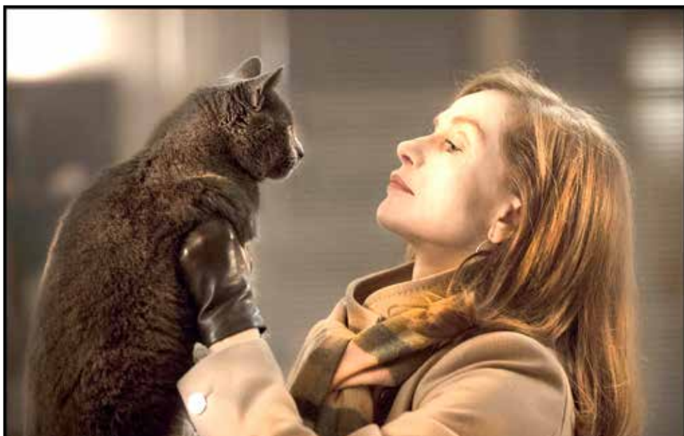
ELLE, Feb. 10-16

Fri., 2/10 at 2 pm and 6 pm; Sat., 2/11 at 7:45 pm; Sun., 2/12 at 3 pm; Mon., 2/13 at 6 pm; Tue., 2/14 at 8 pm; Wed., 2/15 at 6 pm; Thu., 2/16 at 8 pm