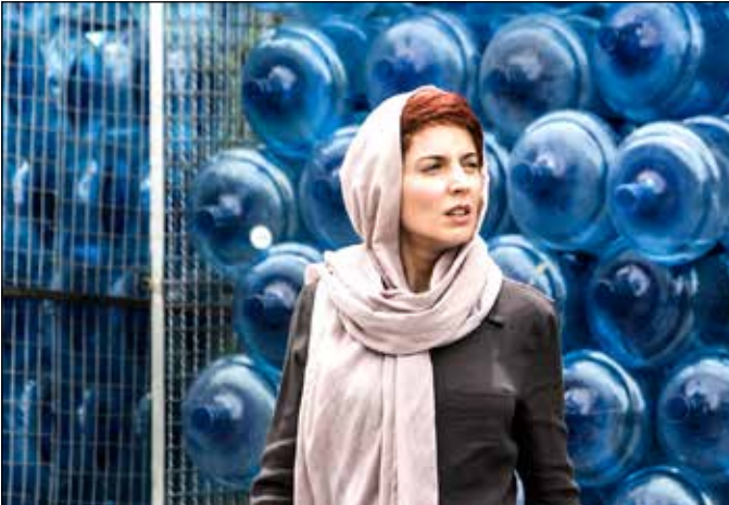
ME, Feb. 4, 5