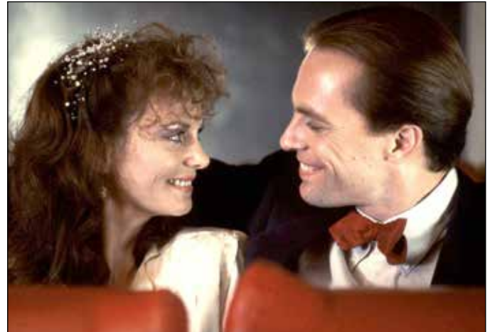
CHOOSE ME, April 15, 18