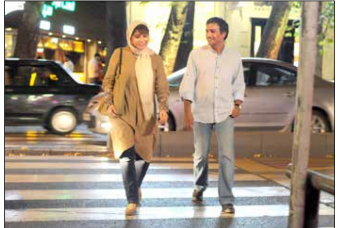
INVERSION, Feb. 11, 12