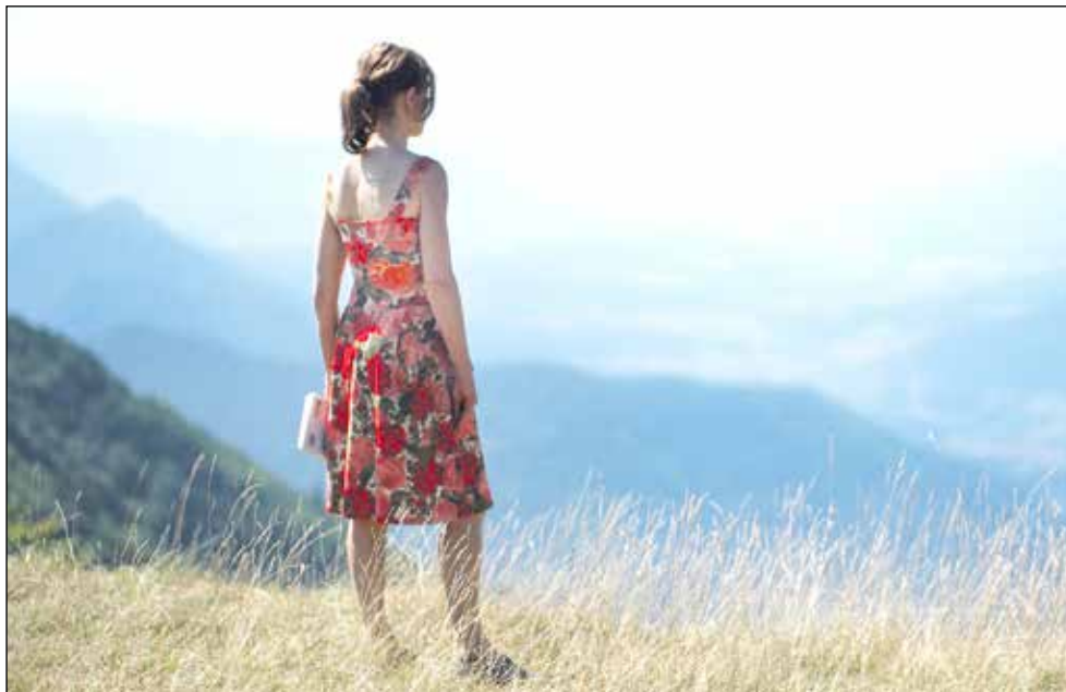
THINGS TO COME, Feb. 24-March 2

Fri., 2/24 at 2 pm; Sat., 2/25 at 6:30 pm; Mon., 2/27 at 6 pm and 8 pm; Tue., 2/28 at 8 pm; Wed., 3/1 at 6 pm and 8 pm; Thu., 3/2 at 8:15 pm