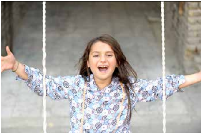
BREATH, Feb. 11, 12