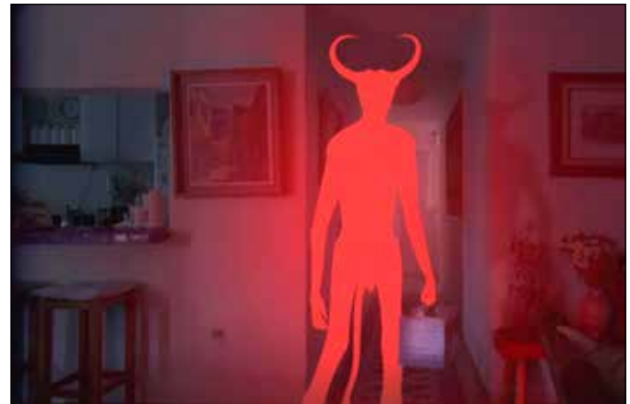
POST TENEBRAS LUX, Feb. 24, 28