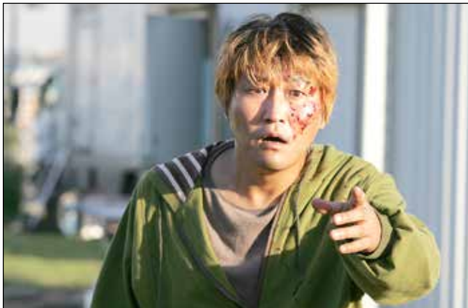
THE HOST, Feb. 21