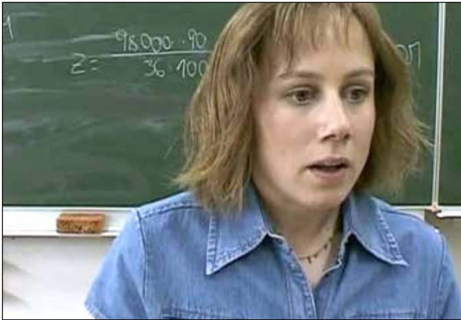
THE FOREST FOR THE TREES, Feb. 11, 16

The Cannes sensation TONI ERDMANN, perhaps the best received foreign film of the year, vaulted Maren Ade into the top rank of world directors. Her talent was already apparent in two critically esteemed but little-seen earlier works, presented here in 35mm prints.