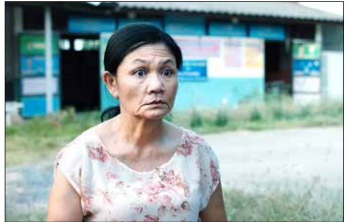
CEMETERY OF SPLENDOR, Feb. 10, 14