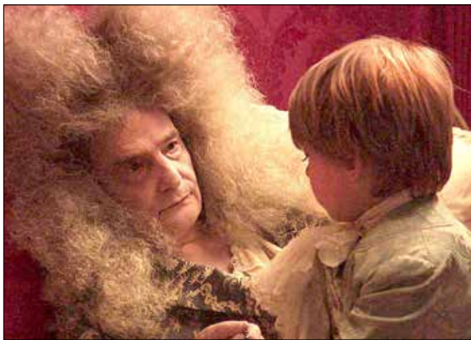
THE DEATH OF LOUIS XIV (France)