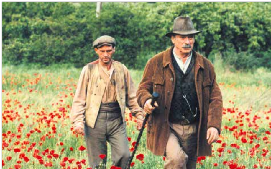
JEAN DE FLORETTE, Feb. 24, 25, 27