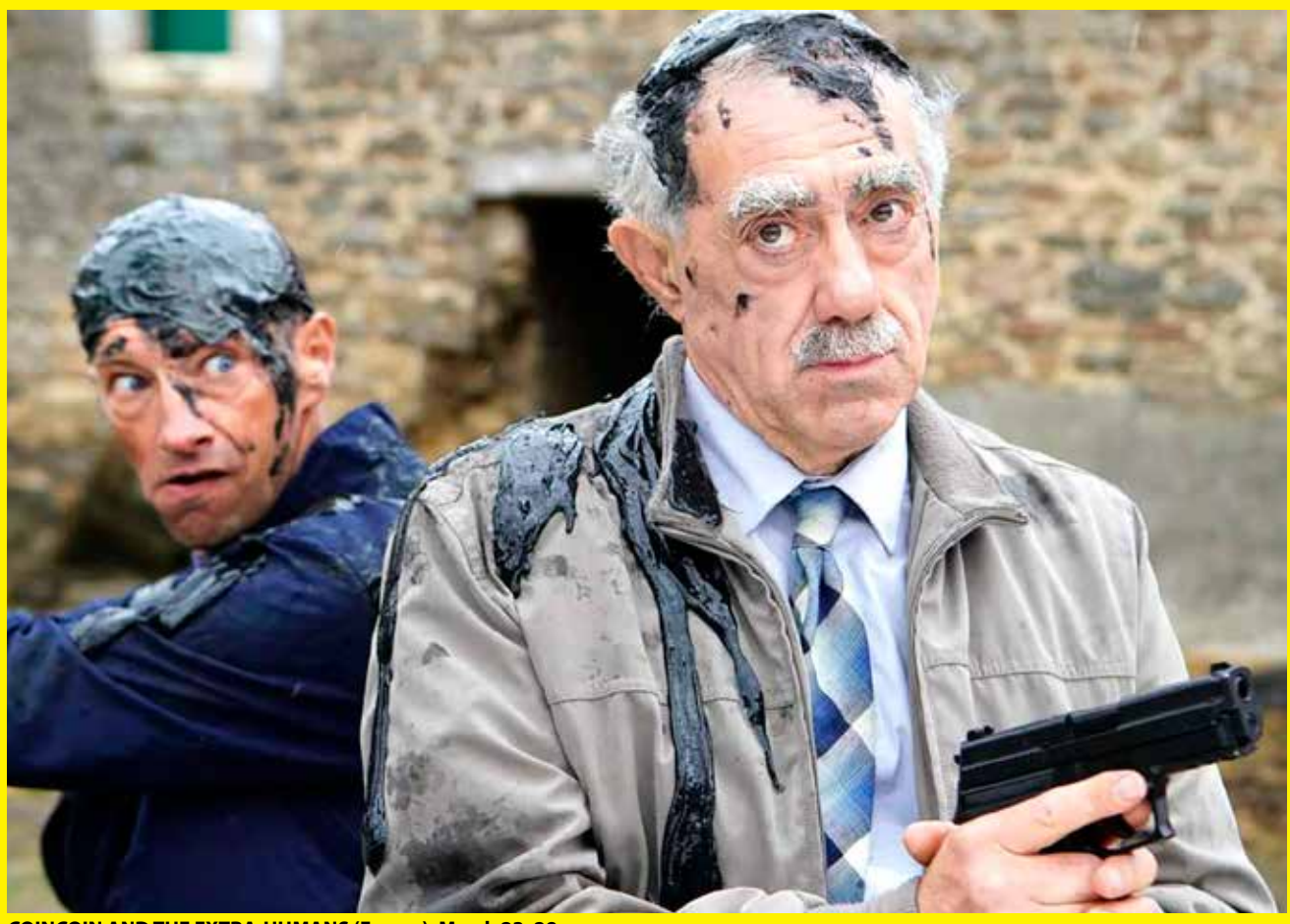
COINCOIN AND THE EXTRA-HUMANS (France), March 23, 28

From March 8 through April 4, the Gene Siskel Film Center welcomes you to our 22nd Annual Chicago European Union Film Festival. This largest festival in North America exclusively showcasing films from the European Union brings the vibrant cultures of Europe to the comfort of your theater seat, with 60 Chicago premieres representing all 28 EU nations.