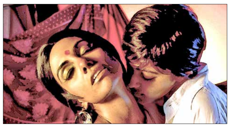
Disorienting Diasporas, March 28

Curated by the Queer Media Database Canada-Québec Project (QMDCQ) in partnership with the Montréal-based collective Taklif, this program brings together work by Brown diasporic artists who elude the logic of either/or in favor of the