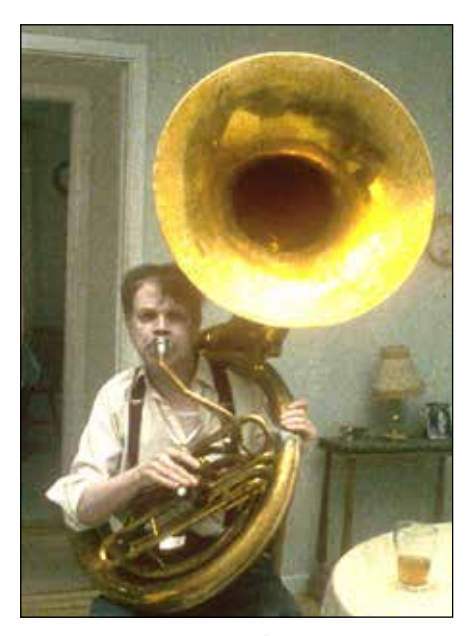
YOU, THE LIVING, March 28

A virginal teenager in Gravesend, Brooklyn, sets her sights on a a college boy rumored to sleep around indiscriminately. One of the most exciting directorial debuts in recent years. DCP digital. (CW)