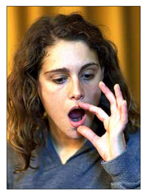
ATTENBERG, March 14