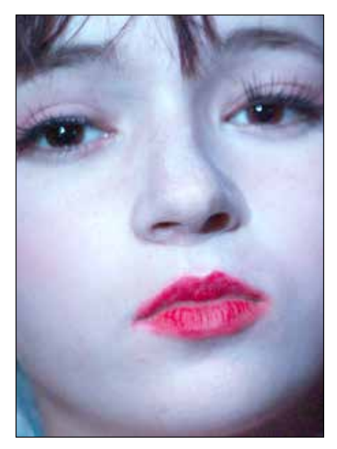
IT FELT LIKE LOVE, March 21

At odds with her dull hometown, Marina makes furtive steps towards the adult relationships that have eluded her. A landmark of the "Greek weird wave." In Greek with English subtitles. 35mm. (CW)