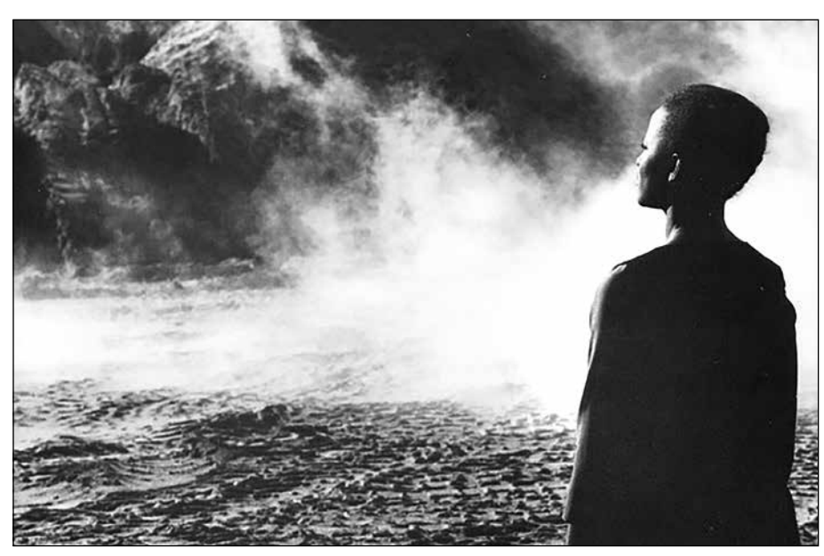
THE PASSION OF REMEMBRANCE, March 9