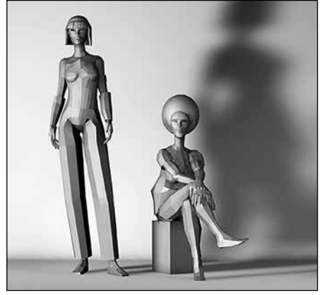
Hyphen-Labs, March 30

Hyphen-Labs is an international collective of women artists, designers, engineers, game-builders, and writers known for works that merge art, technology,