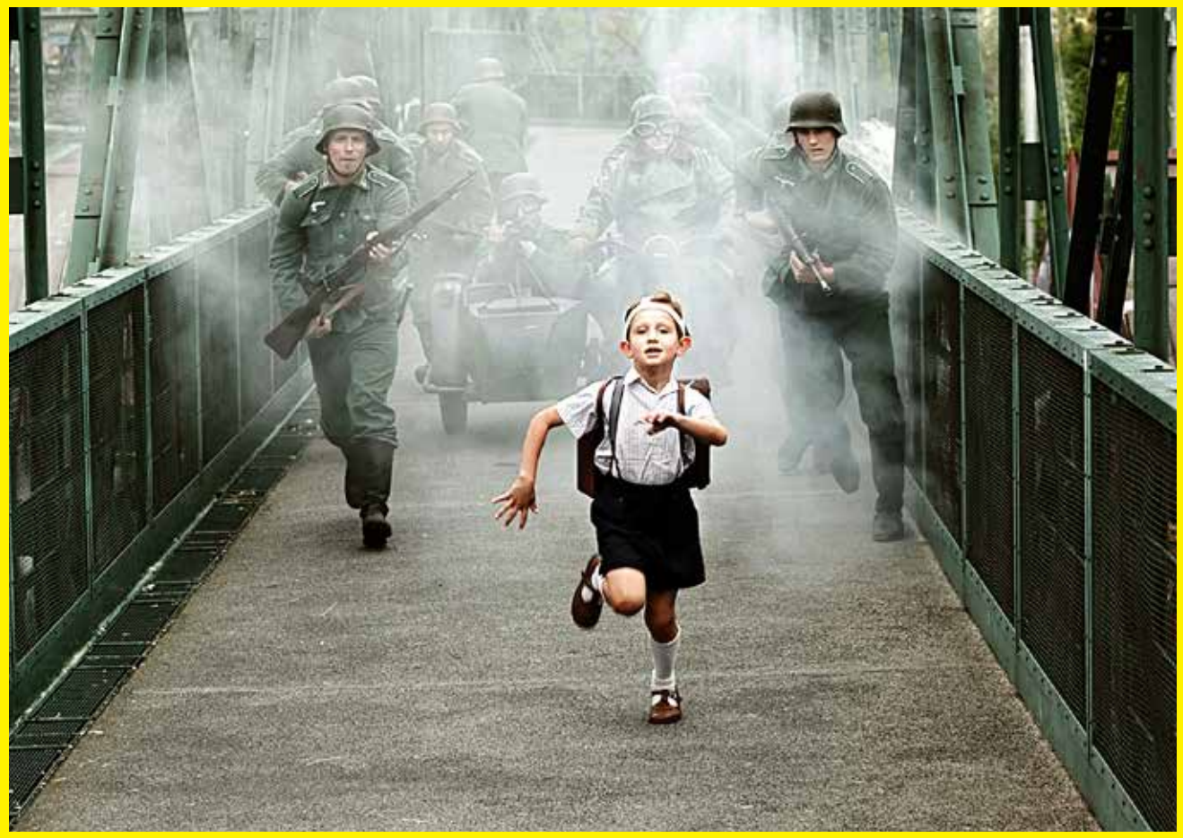
BAREFOOT (Czech Republic), March 11, 12

From March 9 through April 5, the Gene Siskel Film Center welcomes you to our 21st Annual Chicago European Union Film Festival. This largest festival in North America exclusively showcasing films originating in the European Union brings the vibrant cultures of Europe to the comfort of your theater seat, with 61 Chicago premieres representing all 28 EU nations.