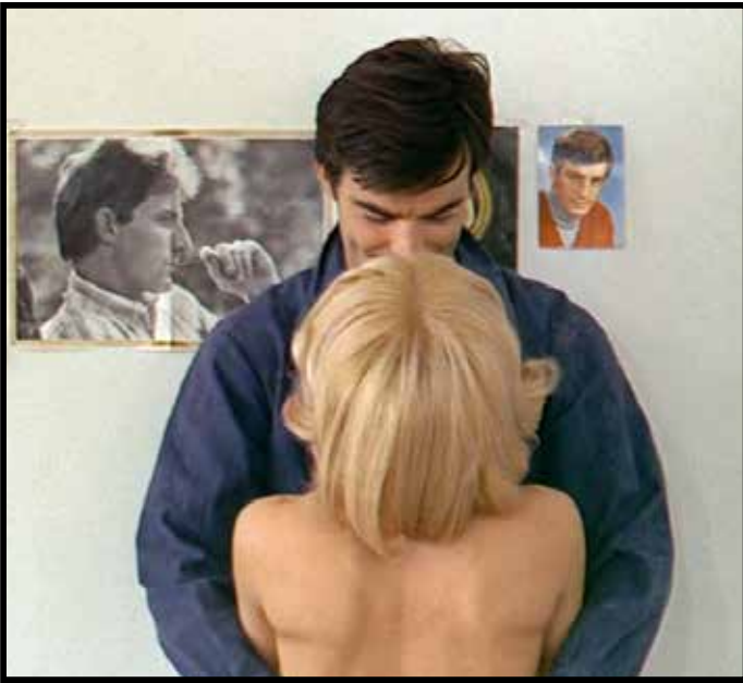
LE BONHEUR , May 15, 18