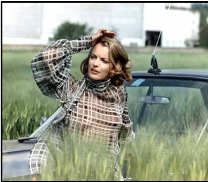
CÉSAR AND ROSALIE , May 21, 26