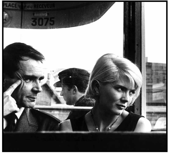
CLEO FROM 5 TO 7 , May 15, 16