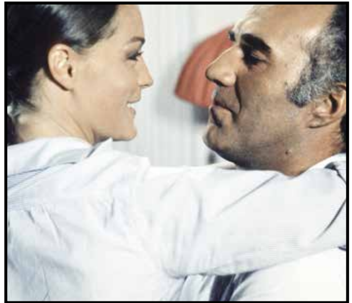
LES CHOSES DE LA VIE , May 21, 24