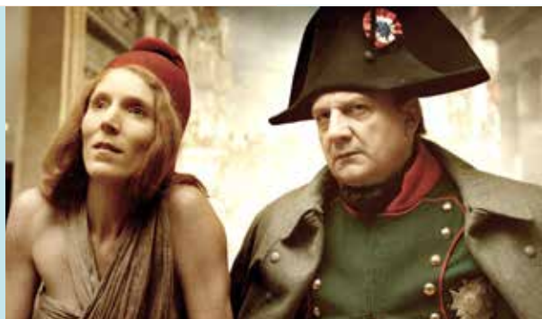
FRANCOFONIA, May 6-19