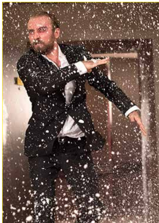
11 MINUTES, April 29-May 5