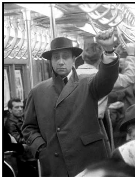
TWO MEN IN MANHATTAN, May 28, 31