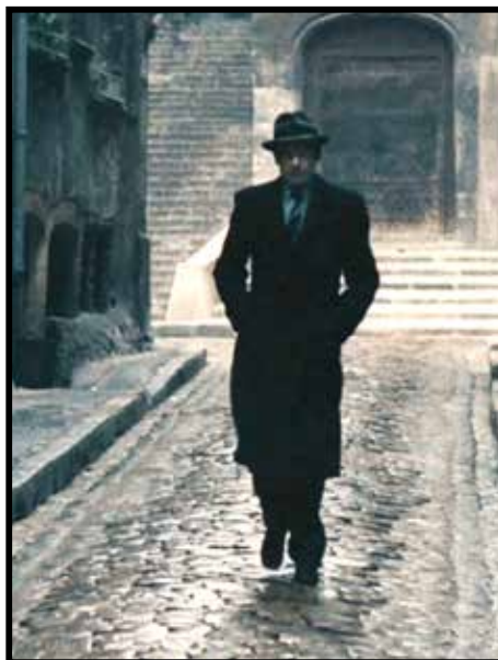
ARMY OF SHADOWS, May 28, June 2

Melville's fascination with America infuses this dusk-to-dawn noir (set and partially filmed in NYC) in which he plays a French reporter sent to find a vanished UN delegate. In French and English with English subtitles. DCP digital restoration. (MR)