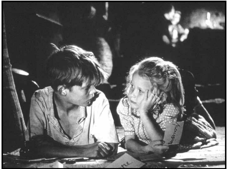
FORBIDDEN GAMES, May 7, 9