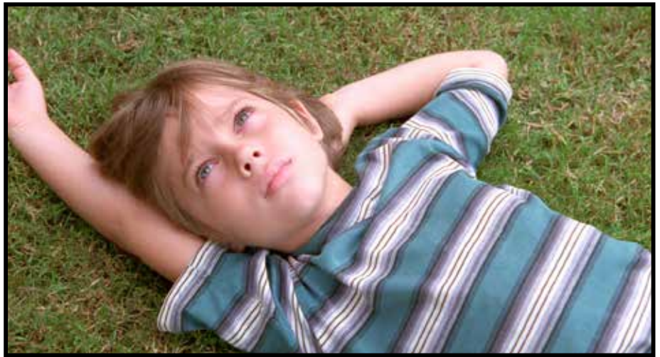
BOYHOOD, May 7, 10

This Oscar nominee is told through the eyes of an African village girl who is kidnapped by a guerilla army at age twelve and forced to serve as a child soldier. In French with English subtitles. DCP digital. (MR)