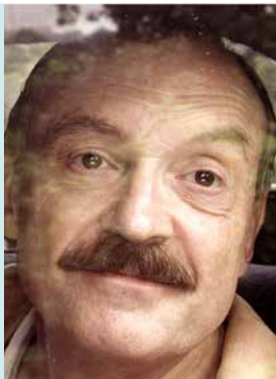
STEFAN ZWEIG: FAREWELL TO EUROPE, July 21-27