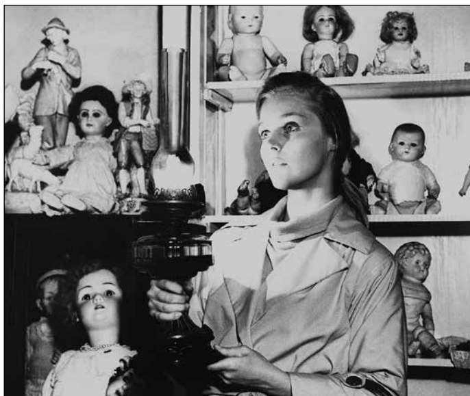
BUNNY LAKE IS MISSING , Aug. 15, 20