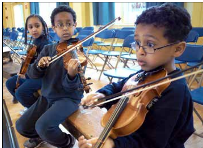
CRESCENDO! THE POWER OF MUSIC, Aug. 16, 18