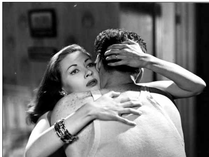
CRISS CROSS, Aug. 29, 31