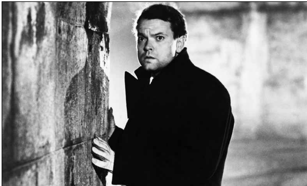
THE THIRD MAN, Aug. 7, 8

Reed's classic thriller, scripted by Graham Greene and featuring a legendary performance by Welles, was voted the greatest British film of all time in a 1999 BFI poll. A naïve American pulp writer (Cotten) is plunged into the real-life intrigue of postwar Vienna, a black-market mecca haunted by the specter of his recently deceased friend, the mysterious Harry Lime. New 4K DCP digital restoration. (MR)