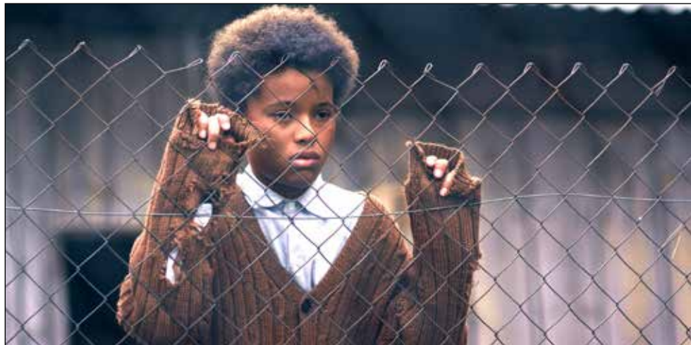
SHORTAGE OF CHILDREN (International Visions), Aug. 11