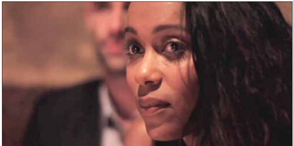
LAST NIGHT, Aug. 14, 15

In the romantic spirit of BEFORE SUNRISE, LAST NIGHT spins an unexpected adventure when discontented young businessman Jon (Gavigan) spots practically-engaged fashion model Sky (Blair) in a Washington, D.C., coffee shop. A casual stroll becomes an all-night ramble, and verbal sparring escalates into soul-baring disclosures between strangers who might never meet again. HDCAM video. (BS)