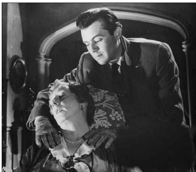
CAST A DARK SHADOW , Aug. 22, 26