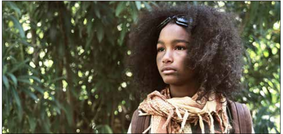
BEYOND THE PASSAGE (Color Me Creative), Aug. 19