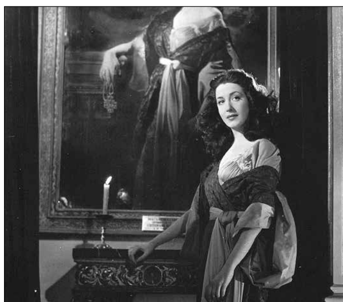
CORRIDOR OF MIRRORS , Aug. 22, 24