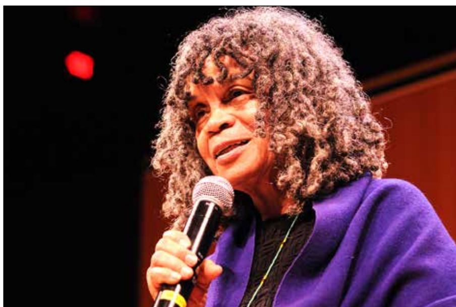
BaddDDD SONIA SANCHEZ, Aug. 11, 12