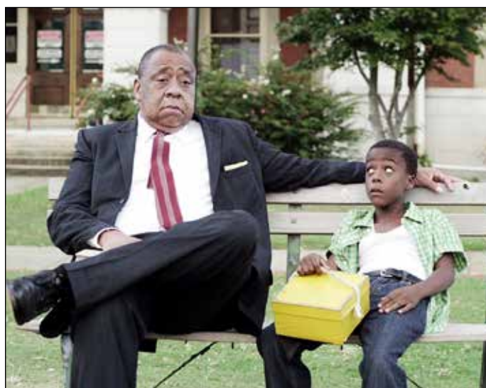
WHITE WATER, Aug. 16, 17