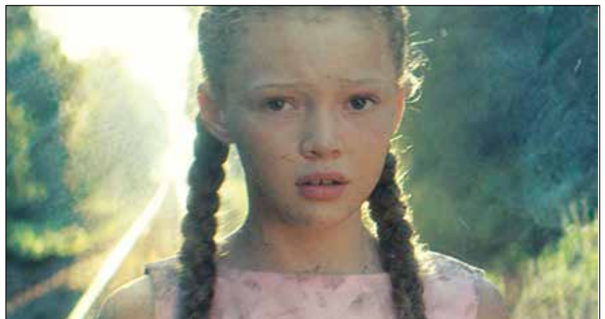
ACROSS THE TRACKS (We Are Family), Sept. 1