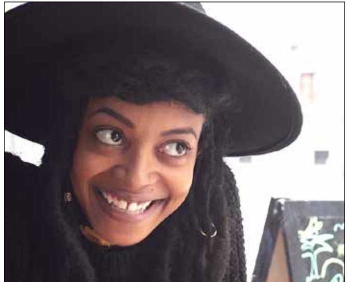
DIDN'T I ASK FOR TEA? (Women of Color), Aug. 25