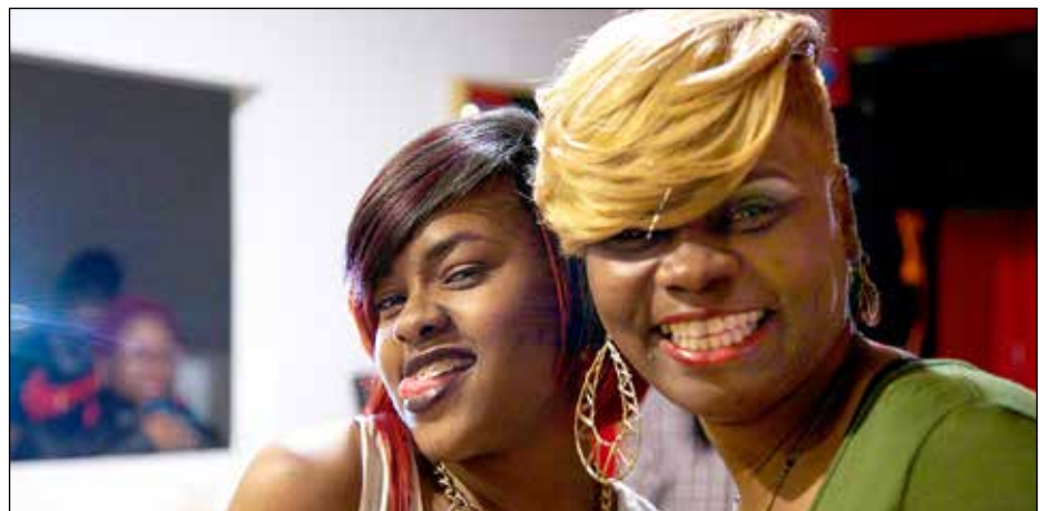
TAKIN' PLACE, Aug. 21, 27