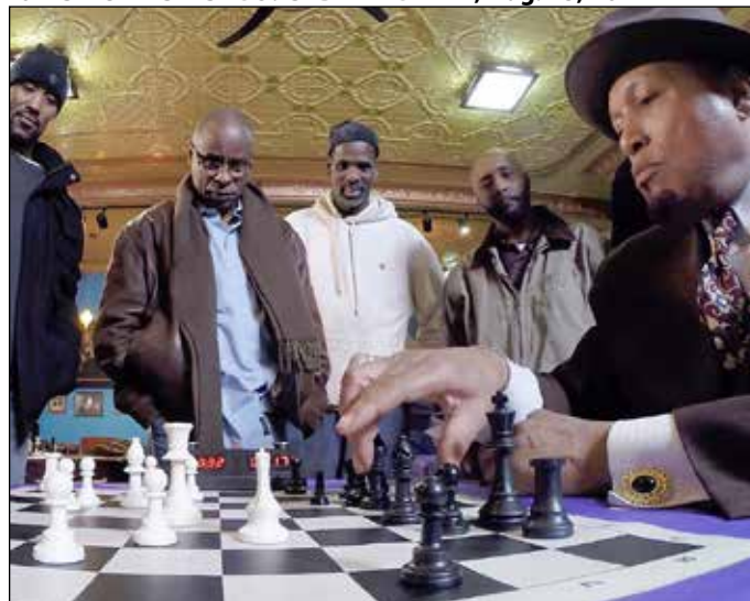
SIDELINE, Aug. 28, Sept. 2