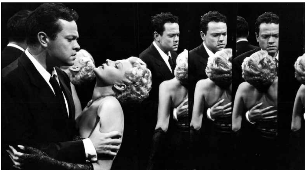
THE LADY FROM SHANGHAI, Aug. 8, 13

Welles's flamboyant thriller casts him as a gullible sailor drawn by a blonde temptress (Hayworth) and her superlawyer husband (Everett Sloane) into a sinister conspiracy that stretches from New York's Central Park to the South American jungle to San Francisco's Chinatown. The climactic hall-of-mirrors shoot-out is one of film history's greatest set pieces. New 4K DCP digital restoration. (MR)