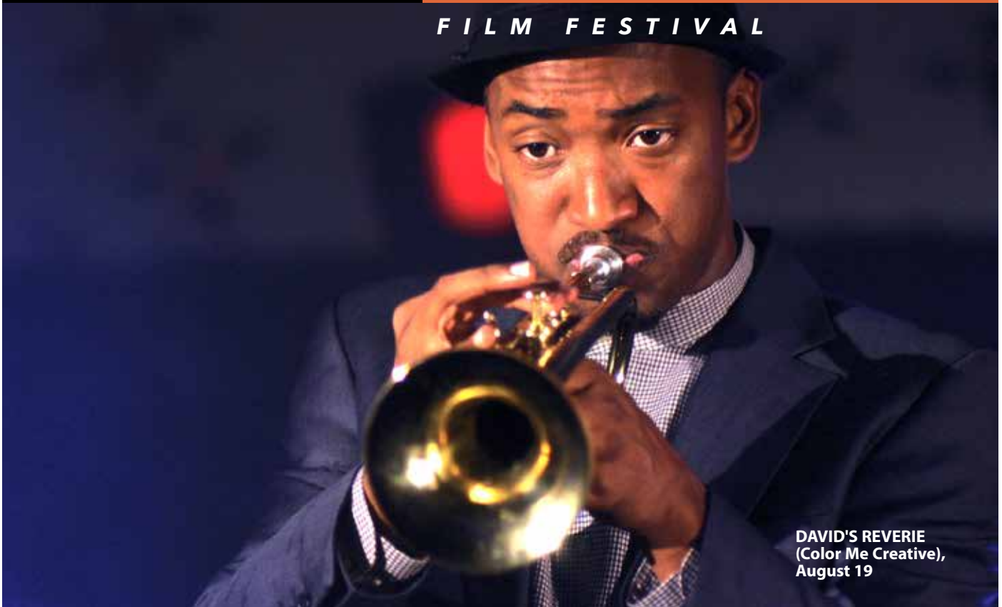
DAVID'S REVERIE (Color Me Creative), August 19

From August 8 through September 3, the Gene Siskel Film Center invites Chicago to celebrate the 21 st edition of the Black Harvest Film Festival , exploring the stories, images, heritage, and history of the black experience in the U.S. and around the world through film and video. Black Harvest most especially promotes dialogue, and we feature many personal appearances for audience discussion.