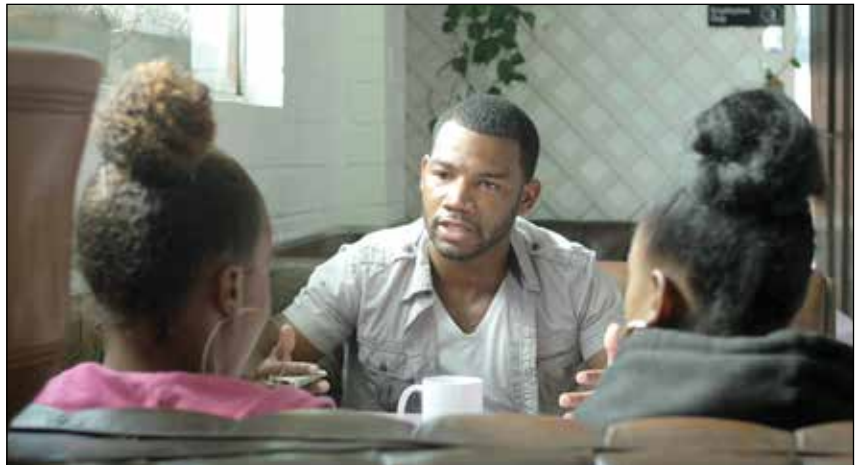
CANCER PIMP (Black Noir), Aug. 31