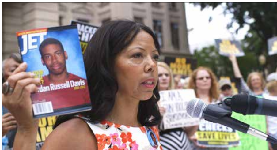
3½ MINUTES, TEN BULLETS, Aug. 9, 10