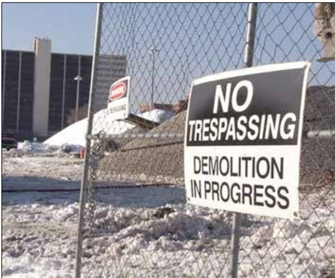
70 ACRES IN CHICAGO: CABRINI GREEN, Aug. 23, 26