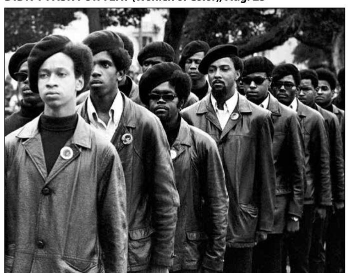
THE BLACK PANTHERS: VANGUARD OF THE REVOLUTION, Aug. 29