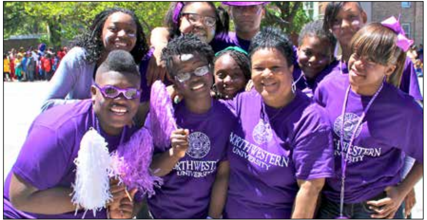
COLLEGE WEEK, Aug. 30, Sept. 1