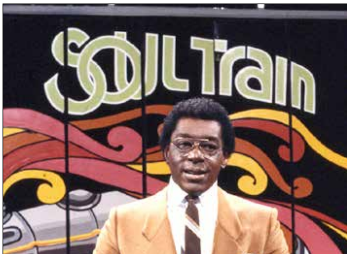
SOUL TRAIN: THE HIPPEST TRIP IN AMERICA, Aug. 15