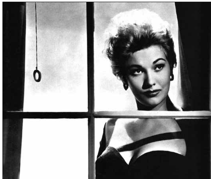
PUSHOVER , Aug. 15, 17