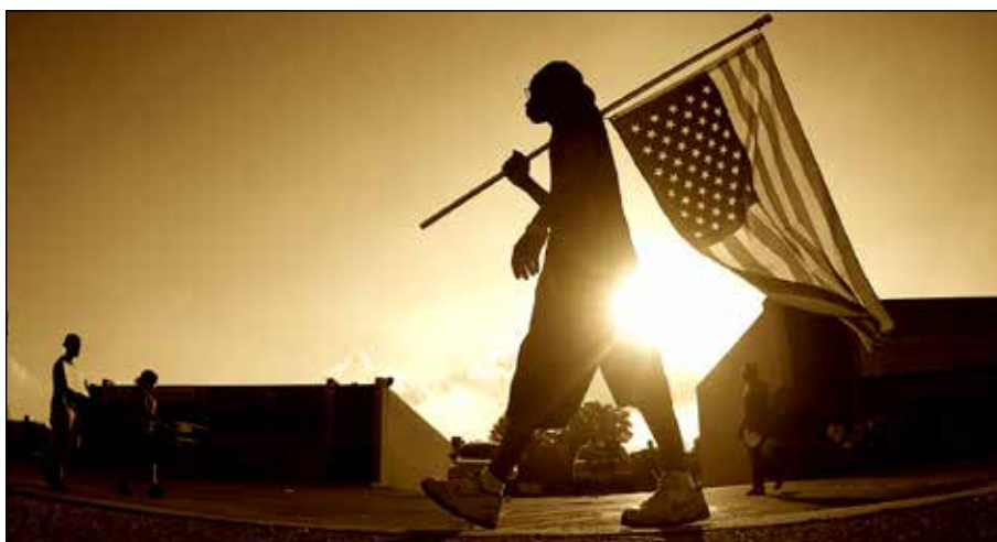
A FERGUSON STORY (MADE IN CHICAGO I), Aug. 9, 13

Lucia McBath, mother of Jordan Davis and National Spokesperson for Moms Demand Action For Gun Sense In America, will be present for audience discussion at both screenings. The audience is invited to a reception hosted by the MacArthur Foundation in our gallery/café following the Sunday screening.