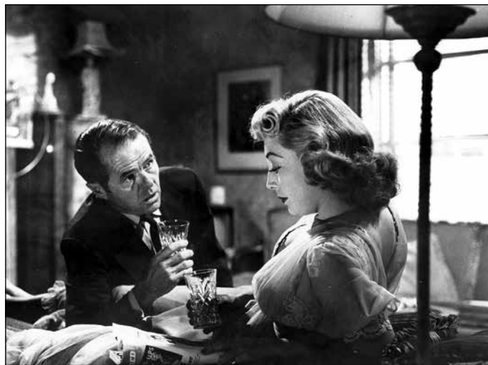
THE KILLING, Aug. 29, Sept. 2

As a fate-blaming patsy and the inconstant ex-wife he can't stay away from, Lancaster and De Carlo make a physically beautiful but emotionally toxic couple, with an armored-car heist providing the trigger for deception and double-crosses. The gripping final act climaxes with perhaps the cruelest last shot in all of noirdom. 35mm. (MR)