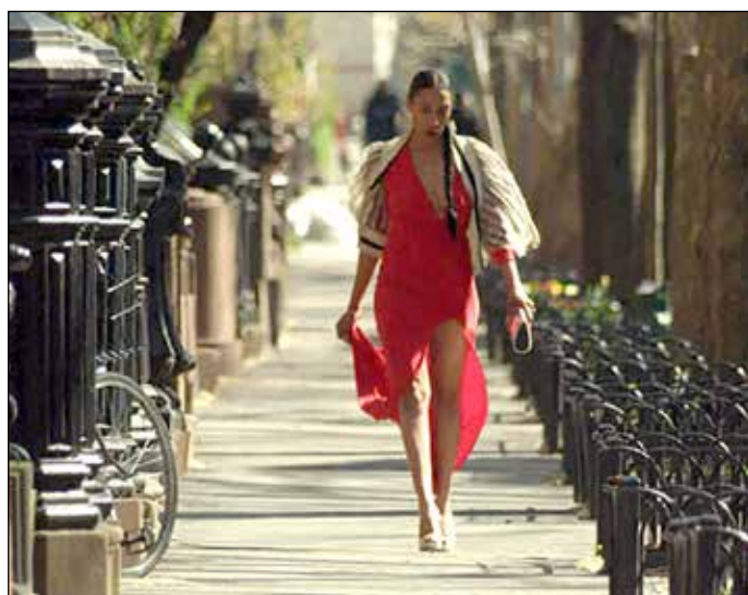
IN THE MORNING, Aug. 18, 19