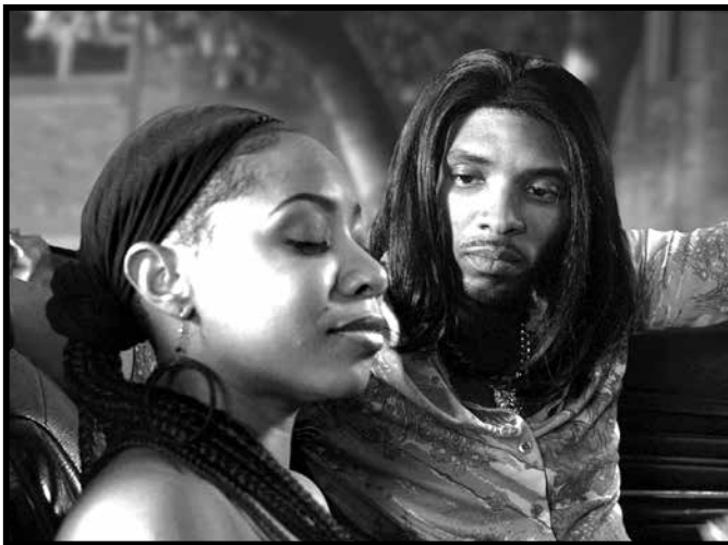
SUNSHINE DAY, Aug. 26, 30