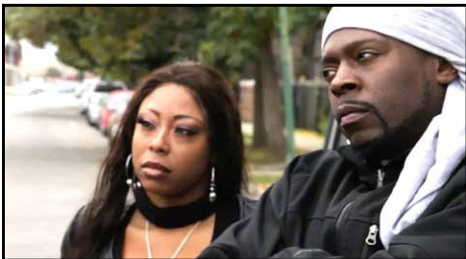
THIS IS NOT CHIRAQ, Aug. 19, 24