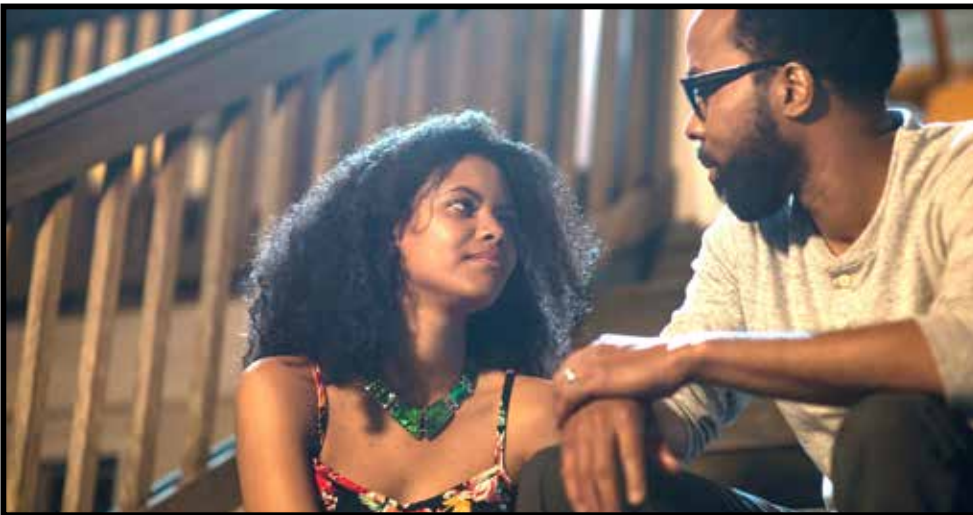
CONFUSED...BY LOVE, Aug. 8, 10