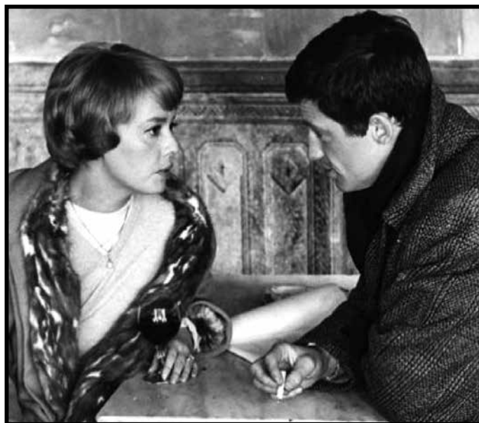
MODERATO CANTABILE , Aug. 13, 15