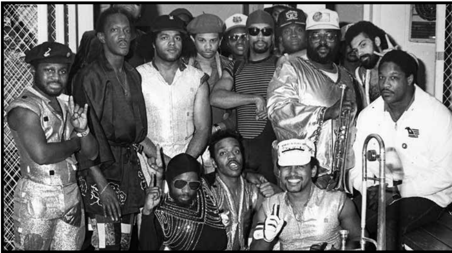
TEAR THE ROOF OFF, Aug. 12, 13