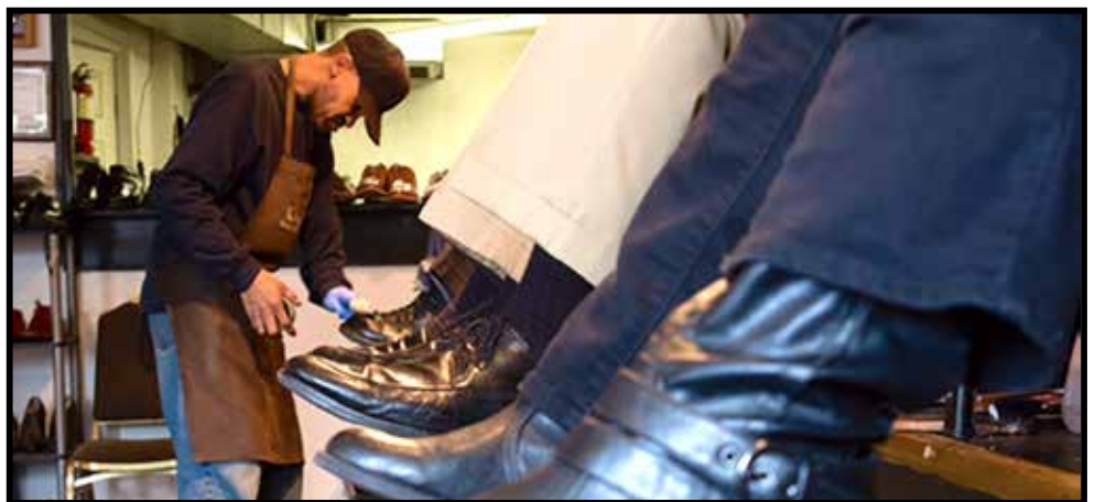
SHINEMEN (Made in Chicago II), Aug. 12, 16