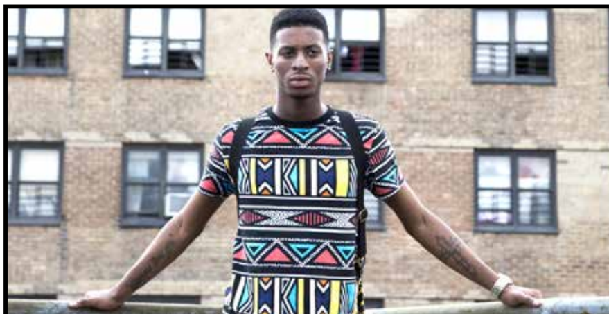
CLASS DIVIDE, Aug. 23

This screening is a Movie Club event (see p. 3).