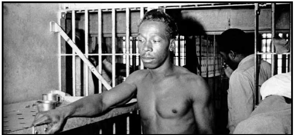
TIME SIMPLY PASSES, Aug. 10