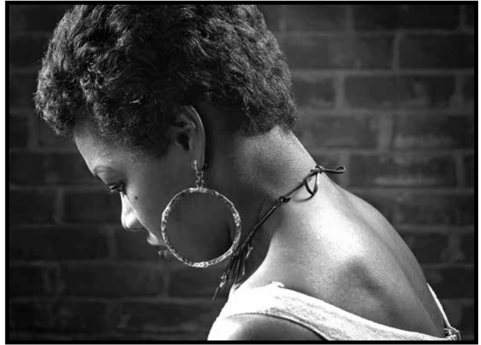
MAYA ANGELOU: AND STILL I RISE, Aug. 27