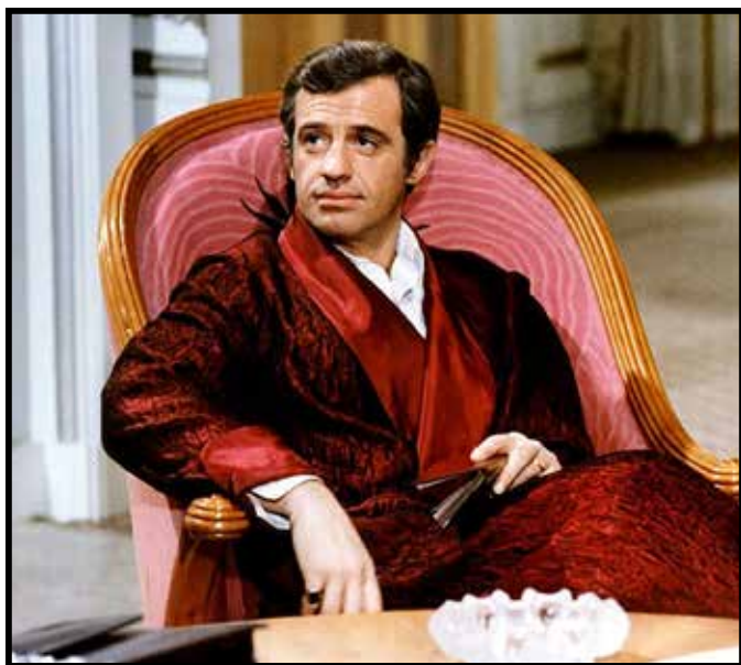
STAVISKY , Aug. 13, 18