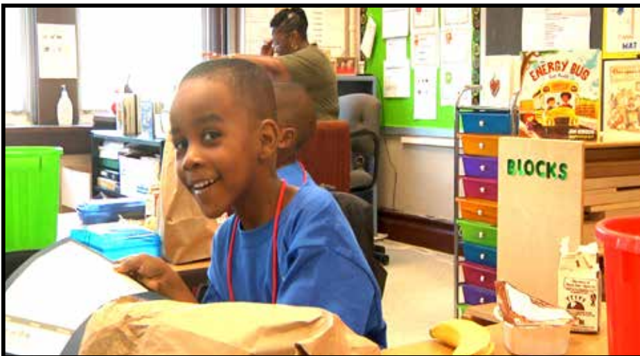
GORDON PARKS ELEMENTARY, Aug. 14