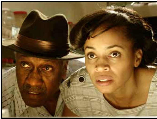
CORA (Women of Color), Aug. 25