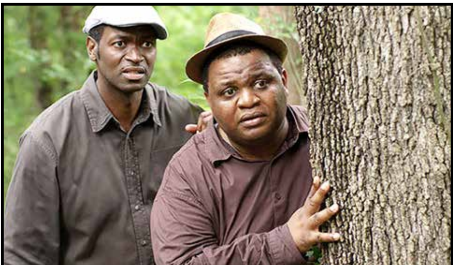
JERICO, Aug. 20, 21