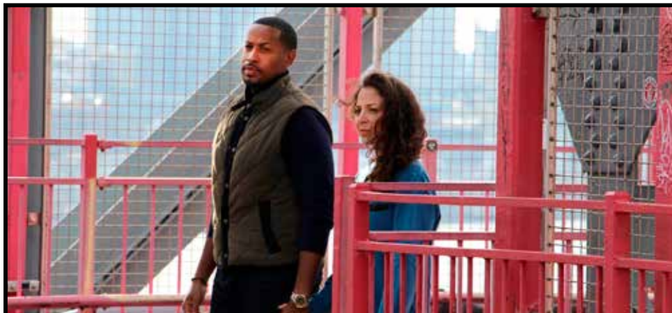
LOVE ISN'T ENOUGH, Aug. 16, 17