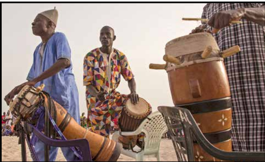
WALK ALL NIGHT: A DRUMBEAT JOURNEY, Aug. 14, 15