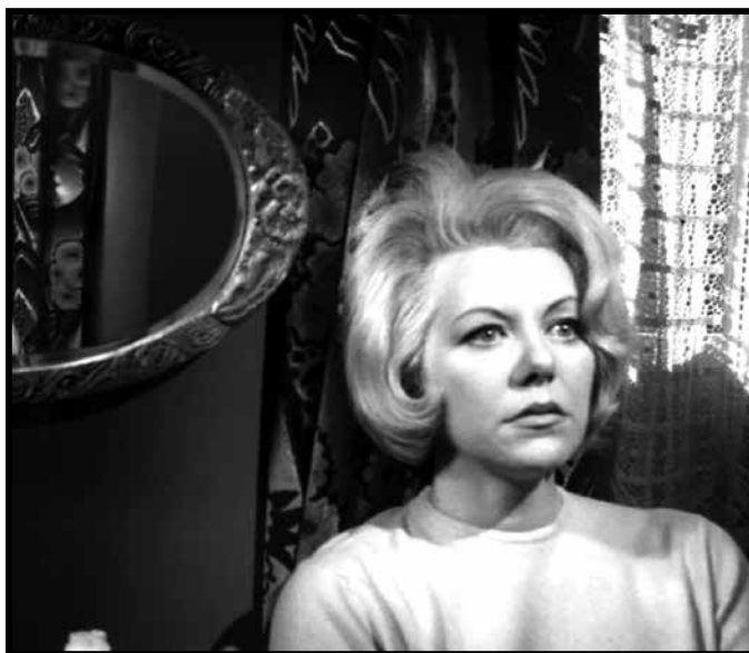
SECOND BREATH , Aug. 20, 22