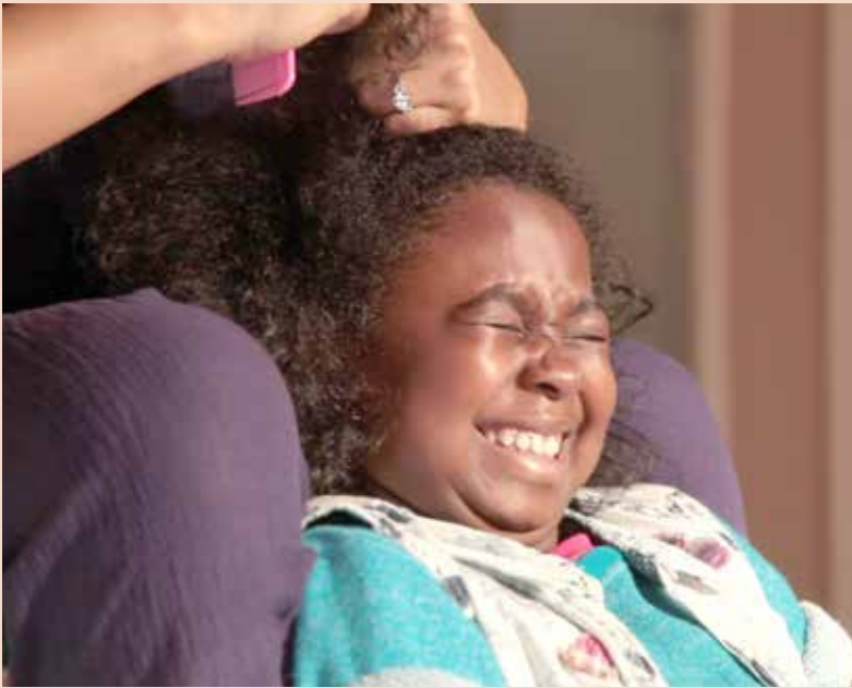
THE BIG CHOP