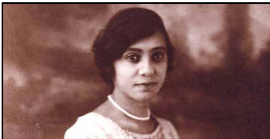
THE CAGED BIRD, Aug. 21