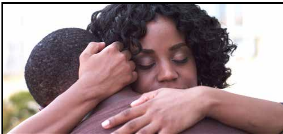
WATCH THIS (We Are Family), Aug. 18