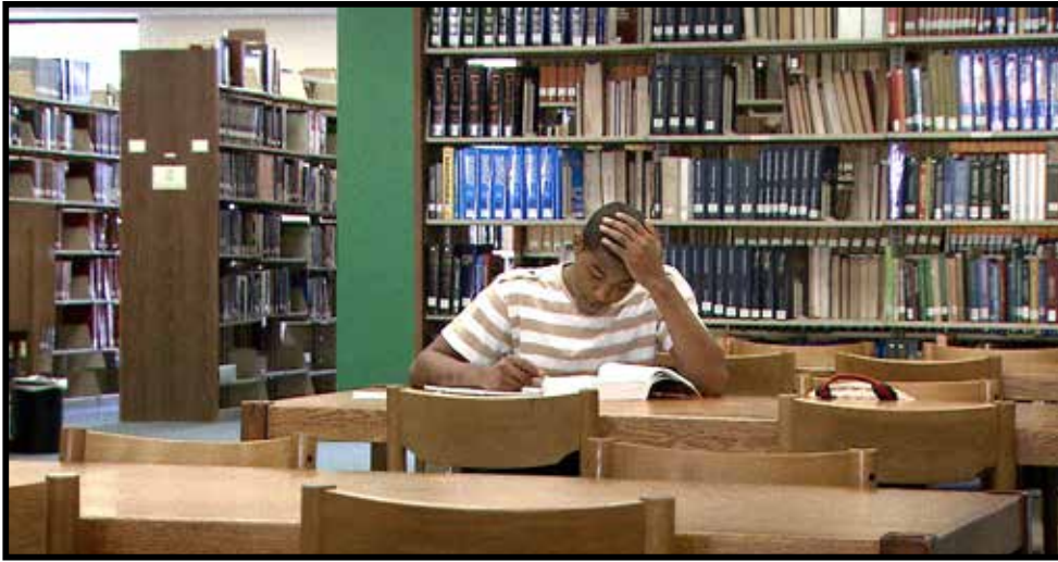
ALL THE DIFFERENCE, Aug. 7, 8