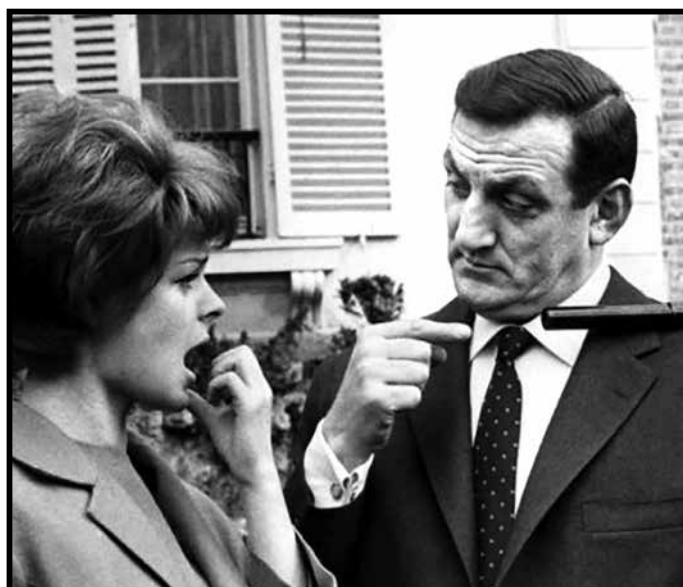
MONSIEUR GANGSTER , Aug. 20, 25