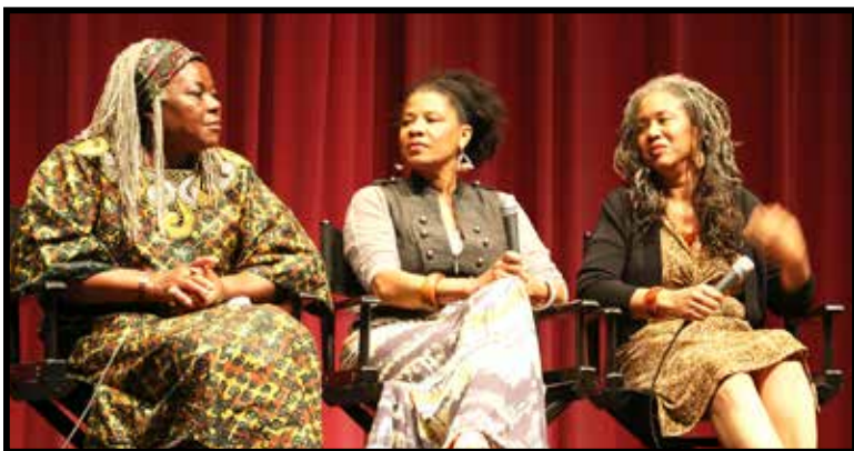
SPIRITS OF REBELLION, Aug. 27