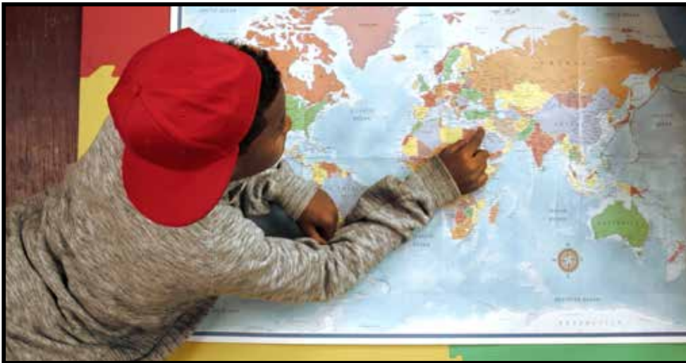
PANGAEA (MADE IN CHICAGO I), Aug. 7, 11