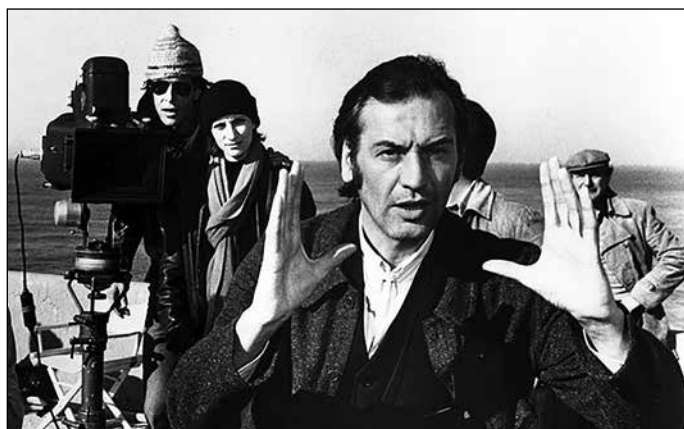
THE STATE OF THINGS, Oct. 24, 28