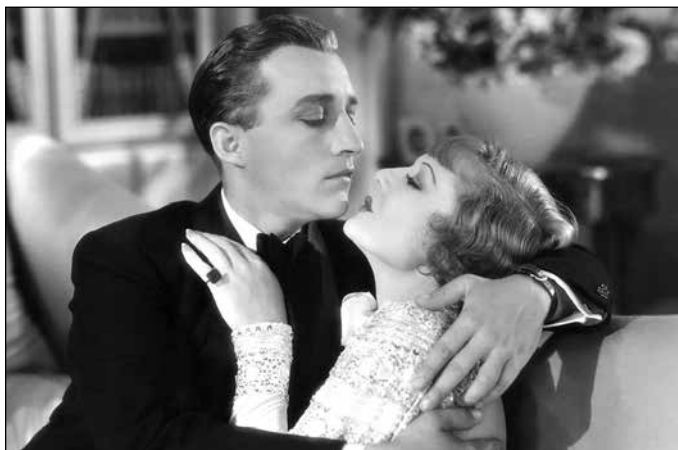
THE BIG BROADCAST, Oct. 18, 19