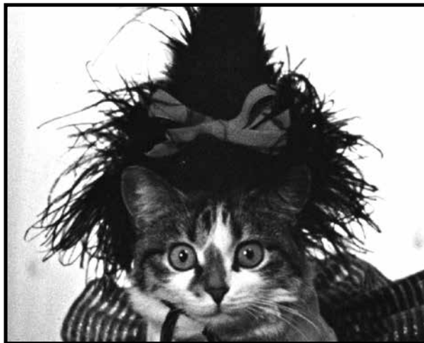
LE JOLI MAI, Nov. 1, 3

Marker's portrait of Paris in the spring of 1962 looks affectionately but often acerbically at a city adrift among the upheavals of urban renewal and the aftershocks of the recent Algerian war. In English and French with English subtitles. DCP digital. (MR)