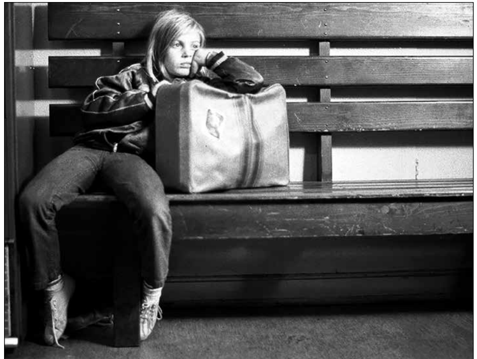
ALICE IN THE CITIES, Oct. 2, 3