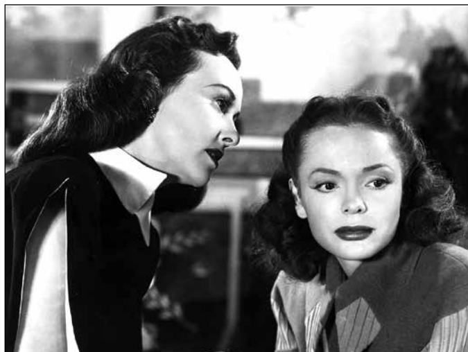
HER SISTER'S SECRET, Oct. 18, 21