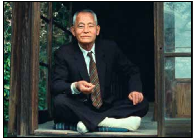
TOKYO-GA, Oct. 31, Nov. 2