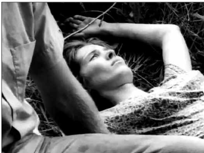
SPRING NIGHT, SUMMER NIGHT, Oct. 11, 12