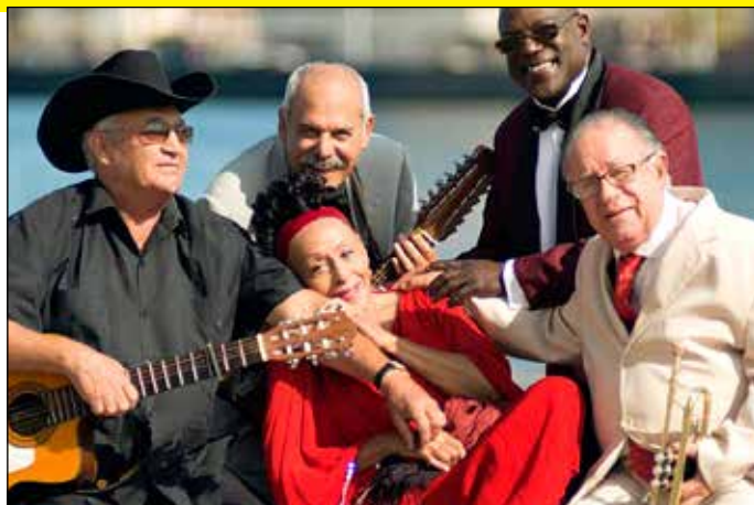
BUENA VISTA SOCIAL CLUB, Oct. 16, 17