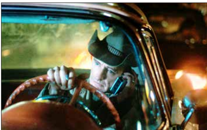
THE AMERICAN FRIEND, Oct. 23, 24