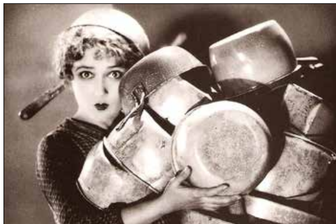
MY BEST GIRL, Oct. 25