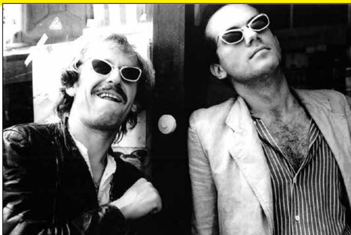
KINGS OF THE ROAD, Oct. 10, 14