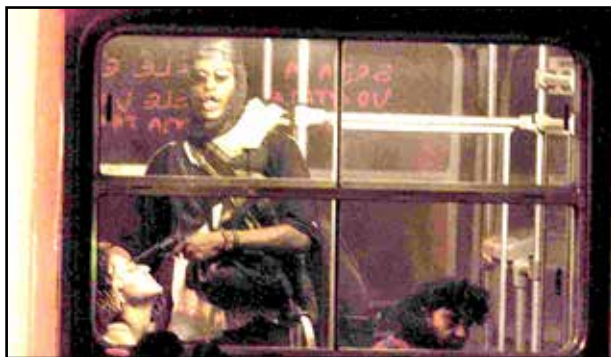
BUS 174, Oct. 29, Nov. 1

This documentary about a bus hijacking becomes a broader discussion of Brazil's neglect of its poorest citizens. In Portuguese with English subtitles. 35mm print courtesy of Zazen Producoes, and the Sundance Collection at the UCLA Film & Television Archive. (DRQ)