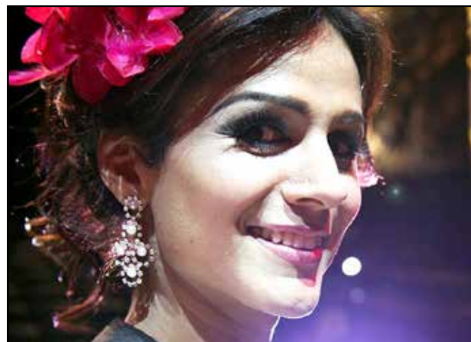
MADE IN BANGKOK, Oct. 22, 24