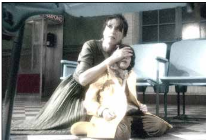
THE SIMILARS, Oct. 28, 31