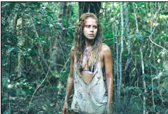
PARADISE LOST, Oct. 14, 20