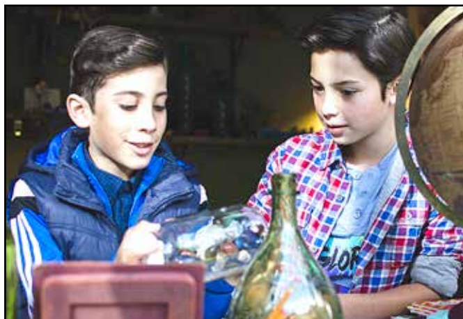
PARALLEL ROADS, Oct. 16, 17