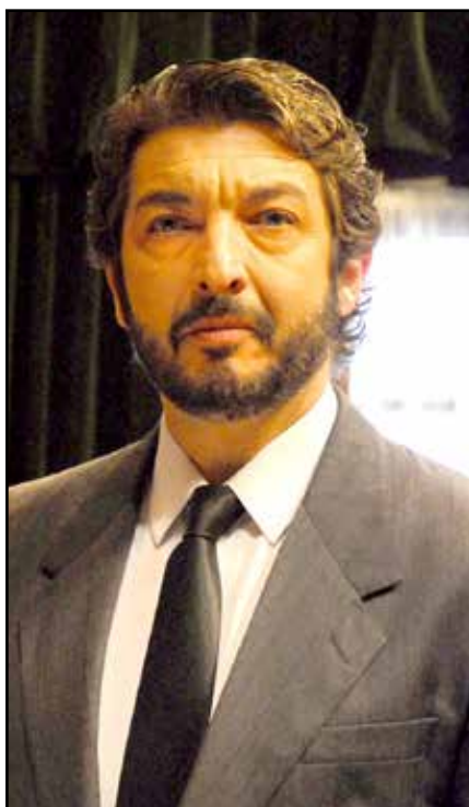
THE SECRET IN THEIR EYES, Oct. 1, 4