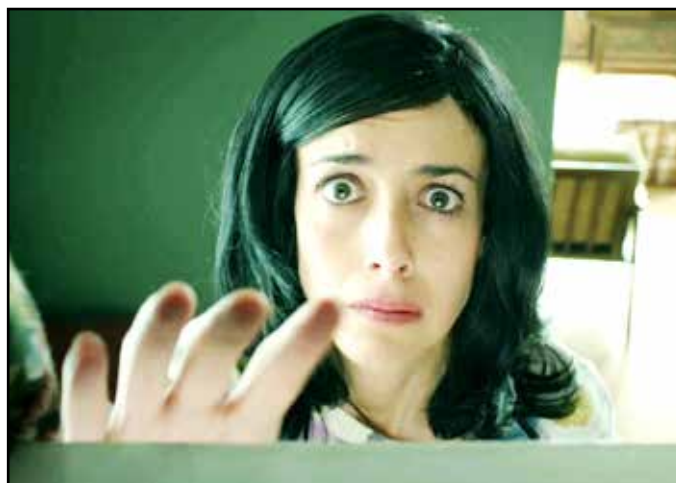
ELVIRA, I WILL GIVE YOU MY LIFE BUT I'M USING IT, Oct. 21, 26