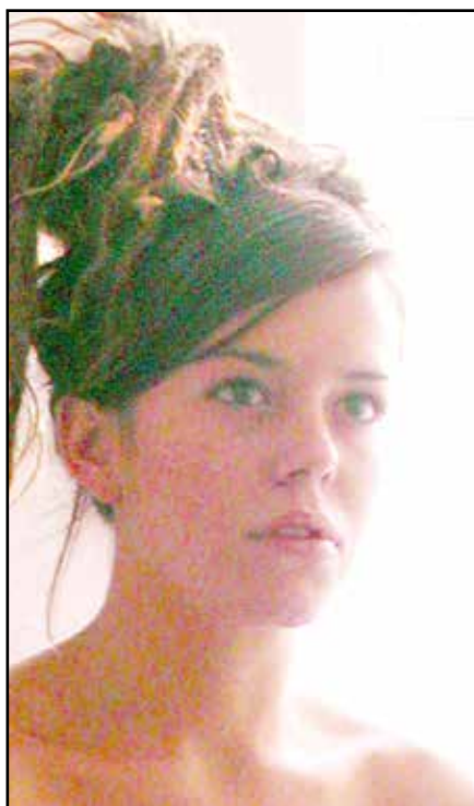
BATTLE IN HEAVEN, Oct. 8, 11

This Oscar-winning blend of murder mystery and love story demonstrates how Argentine cinema's treatment of the dictatorship era has evolved since THE OFFICIAL STORY . In Spanish with English subtitles. 35mm widescreen. (DRQ)