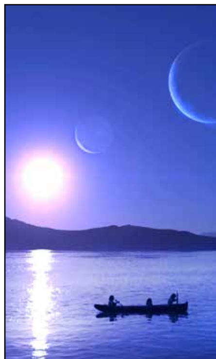
THE PEARL BUTTON, Oct. 15, 18

This powerful, sexually explicit story connects the fates of a lumpish chauffeur and his wife, who ineptly kidnap a baby, with that of a rich girl who runs a brothel for kicks. In Spanish with English subtitles. 35mm. (DRQ)