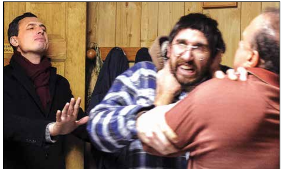
DONALD CRIED, Oct. 19