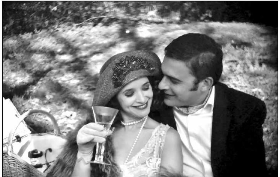
CINEMA, MANOEL DE OLIVEIRA AND ME, Oct. 12

A light dessert reception hosted by the Embassy of Switzerland follows.