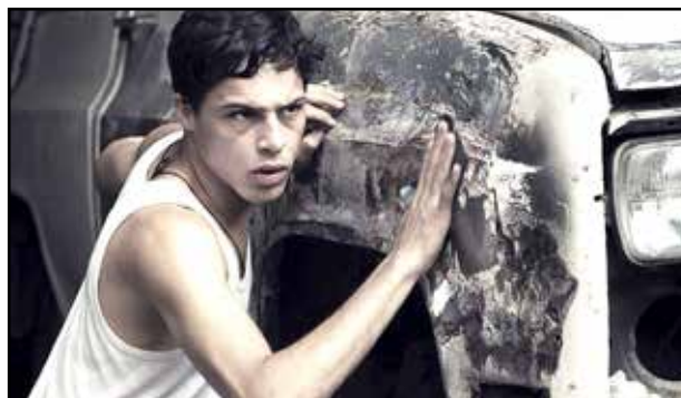
FROM AFAR, Oct. 22, 25

This tale of a middle-aged gay man and a Caracas street thug engages Venezuela's catastrophic present through the prism of machista homophobia and repressed desire. In Spanish with English subtitles. DCP digital. (DRQ)