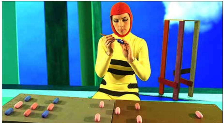
THE PINK EGG, Oct. 12

New York-based artists Gibson and Recoder's latest live work unites the Gene Siskel Film Center's two theaters by cycling the reels of one feature-length film through each of its four 35mm projectors, while glassware and other diffracting media bend, scatter, distort, and redefine the film's image. Joined by Chicago-based musician Brian Case, the three guide the audience between