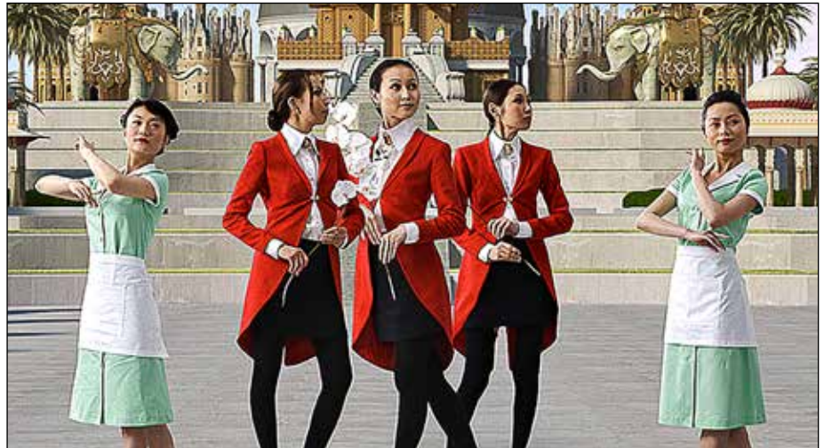
The Real-Fake, Oct. 19

the two spaces to produce a spectral montage in three dimensions. Presented in collaboration with Gallery 400 at the University of Illinois at Chicago.