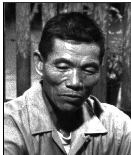
IN SEARCH OF THE UNRETURNED SOLDIERS, February 3, 6

In these two companion-piece documentaries, Imamura journeys to Southeast Asia in search of former Japanese soldiers who abandoned and/or were abandoned by the nation in whose name they fought and, in several cases, committed atrocities. In MALAYSIA , a tangled trail leads to an exiled ex-soldier who has embraced Islam. In THAILAND , a boozy encounter session centers on Fujita, still willing to die for the emperor, and Toshida, scornful of the excesses of blind loyalty. In Japanese with English subtitles. HDCAM video. (MR)