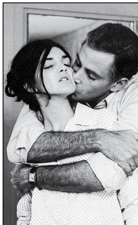
MEMORIES OF UNDERDEVELOPMENT, February 15, 19