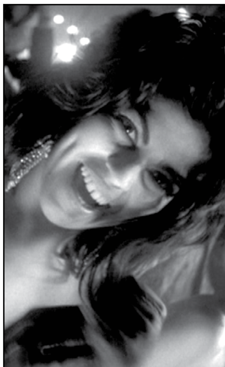
I AM CUBA, February 8, 12