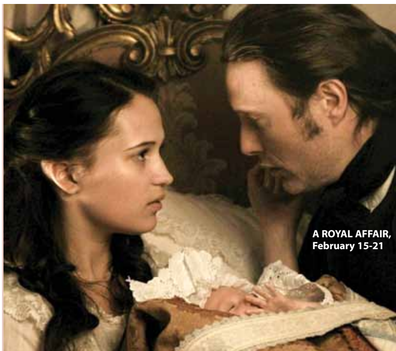
A ROYAL AFFAIR, February 15-21