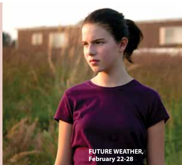
FUTURE WEATHER, February 22-28