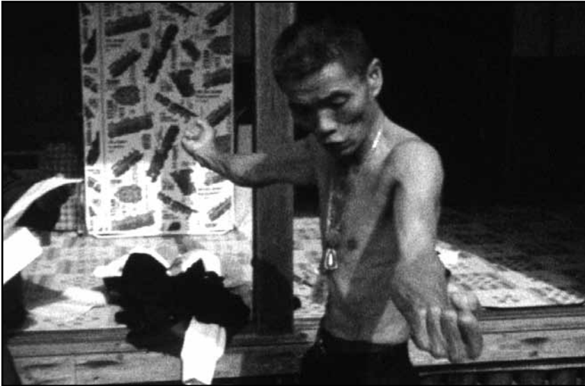
OUTLAW-MATSU COMES HOME, February 10,11