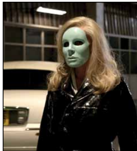
HOLY MOTORS, February 17, 18

Topping many a Ten Best list for 2012, HOLY MOTORS marked Carax’s return to the screen after a long absence. This wild, mythic enigma chronicles a day and a night in the life of the chameleon-like Mr. Oscar (Lavant), a kind of avatar in a white