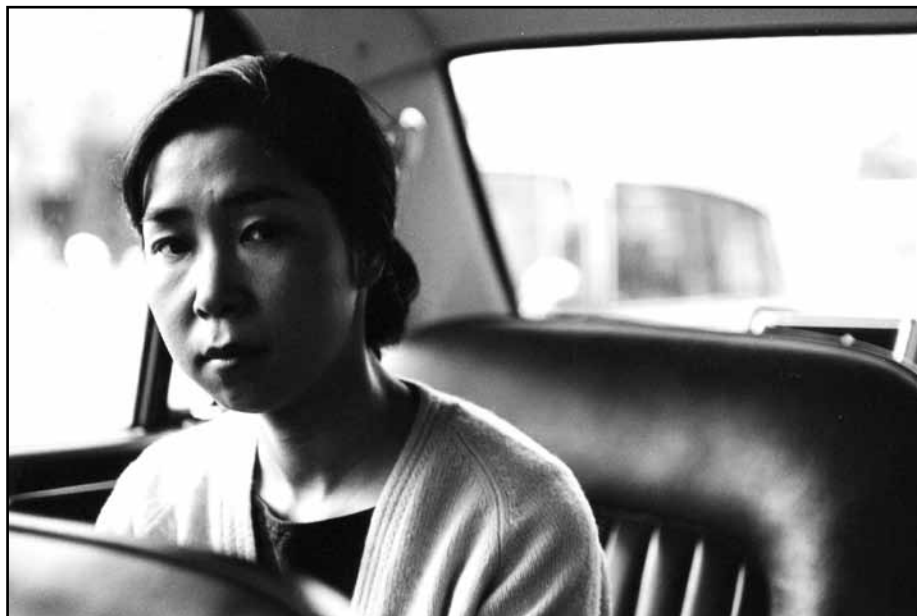
A MAN VANISHES, February 3, 7

This once little-known film has emerged in recent years as one of Imamura's most fascinating and widely discussed works. Its blurring of fact and fiction anticipates such meta-documentaries as Kiarostami's CLOSE-UP and Zhang's QUITTING . It begins as a general investigation of the missing-persons phenomenon in Japan, then focuses on Yoshie, a young woman whose fiancé has disappeared. When she falls in love with Tsuruguchi, the actor hired to interview her, all bets are off. In Japanese with English subtitles. 35mm. (MR)