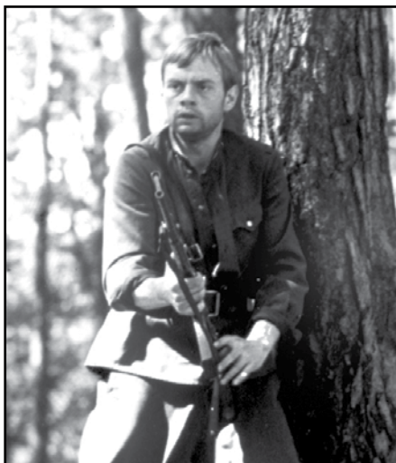
MAMA, I'M ALIVE! , February 2, 4