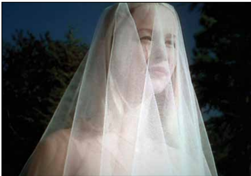
POLA X , February 23, 27