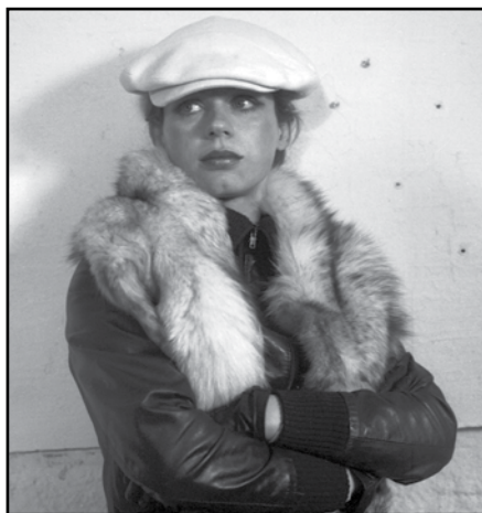
SOLO SUNNY , February 2, 6