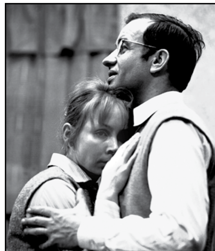
HER THIRD , February 16, 20

JAKOB THE LIAR is the best known East German film in the West—for being the only East German film nominated for an Academy Award, and for being remade (poorly) as a Robin Williams vehicle in 1999. Adapted by Holocaust survivor Jurek Becker from his own novel, it tells of a barber in a Polish ghetto who uses fictitious radio reports to keep up hope among his neighbors as the shadow of deportation grows nearer. Silver Bear at the 1975 Berlin Film Festival. In German with English subtitles. 35mm. (MR)