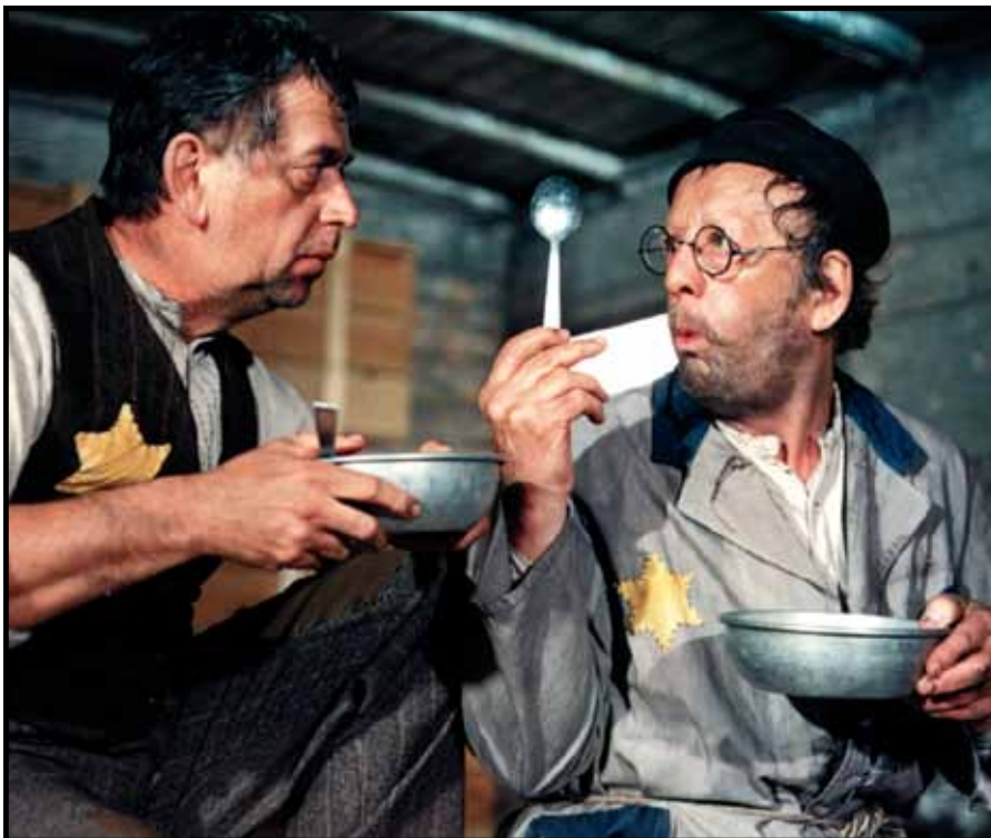
JAKOB THE LIAR, February 9, 11

From February 2 through 28, the Gene Siskel Film Center, in partnership with the Goethe-Institut Chicago and the Spertus Institute, presents Awarded! Films from Behind the Wall , a series of eight honors-winning films produced by DEFA, the state-controlled company that oversaw film production in the GDR aka East Germany.