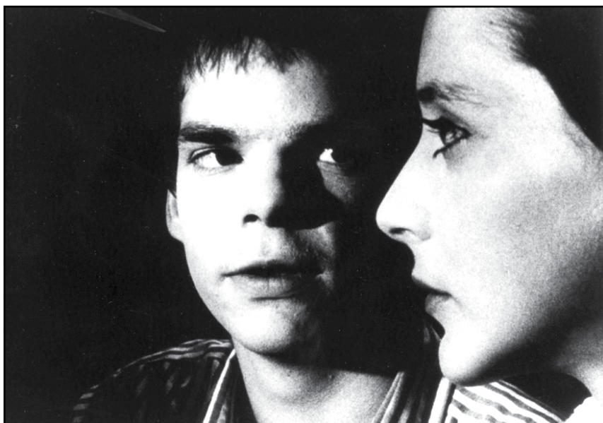
BOY MEETS GIRL , February 23, 25