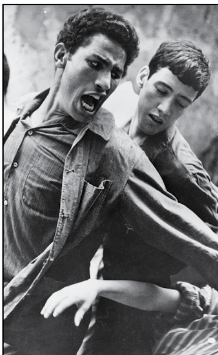
The BATTLE of ALGIERS, February 1, 5