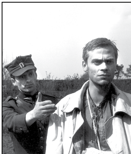
THE TURNING POINT , February 9, 14

This highly regarded war film draws upon Wolf's personal experiences as a soldier in World War II. One of the central themes of East German cinema—the nation's suspended identity between Germany and the Soviet bloc—is neatly encapsulated in this powerful tale of four young German POWs who decide to join the Red Army but find themselves torn by their divided allegiances. East Germany's official submission for the Academy Award. In German and Russian with English subtitles. 35mm. (MR)