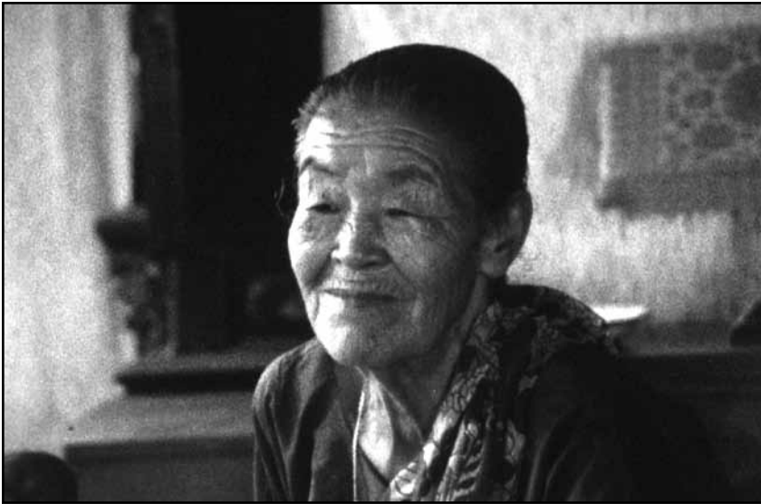
KARAYUKI-SAN: THE MAKING OF A PROSTITUTE, February 8,10