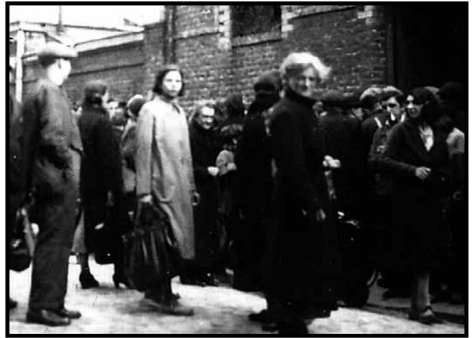
A SONG FOR YOU, January 11, 14