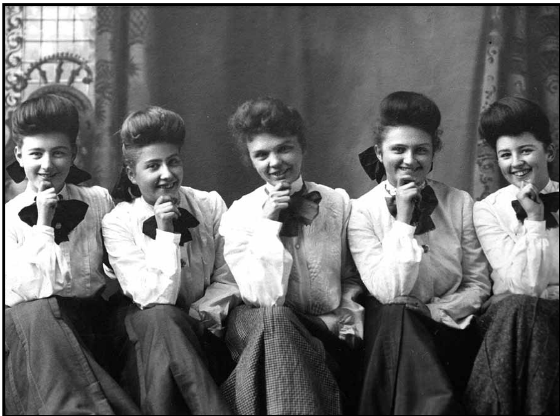
THE HARVEY GIRLS: OPPORTUNITY BOUND, January 4