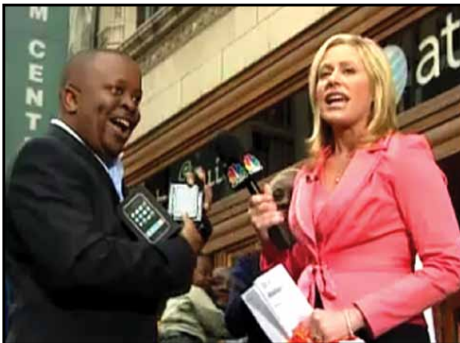
PROPAGANDA, January 18, 21