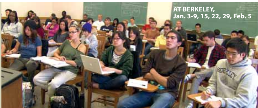
AT BERKELEY, Jan. 3-9, 15, 22, 29, Feb. 5