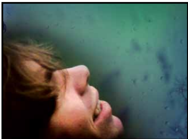
I AM BREATHING, February 1, 3