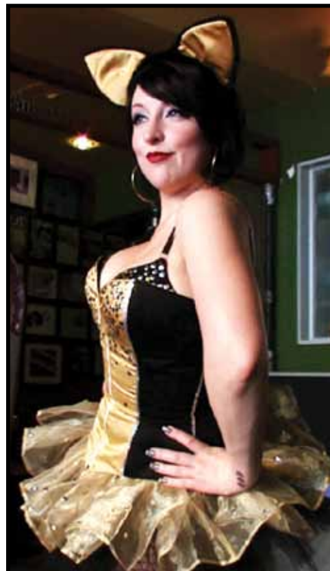
AN HONEST LIVING, January 25, 30