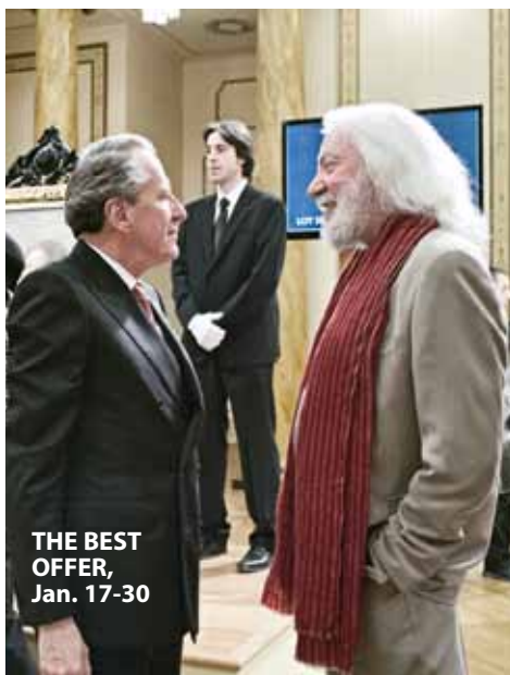
THE BEST OFFER, Jan. 17-30