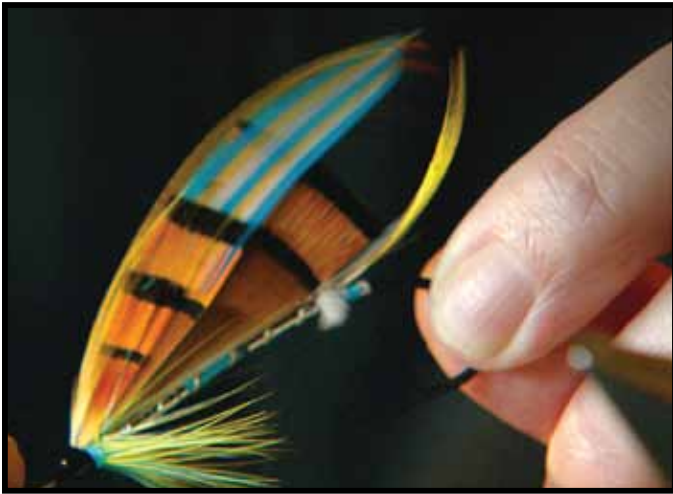
KISS THE WATER, January 4, 6