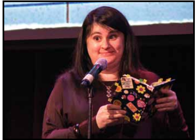
MORTIFIED NATION, January 17, 18