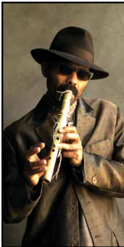
BE KNOWN, January 24, 25, 27