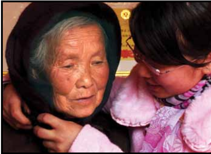
SPILLED WATER, January 10, 11