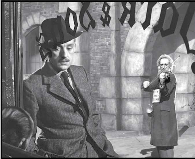
LAST HOLIDAY, July 5, 7