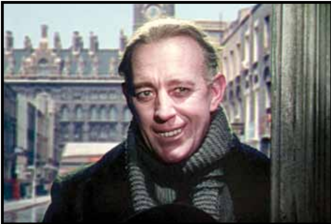
THE LADYKILLERS , July 18, 19