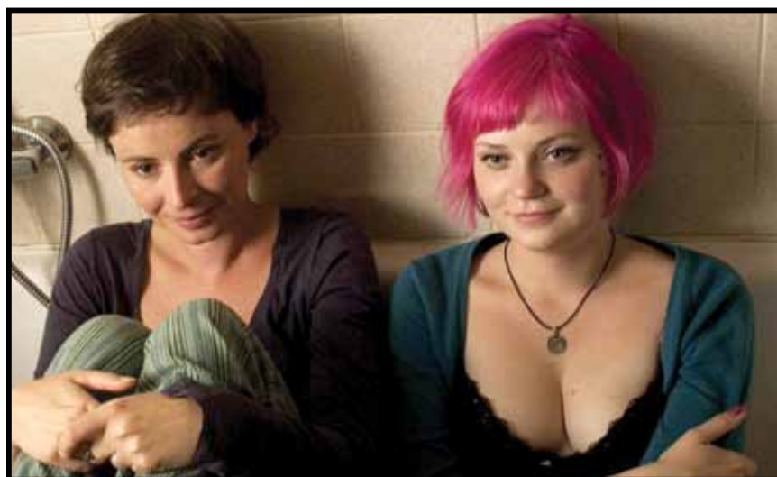
KAWASAKI'S ROSE, July 27, 28