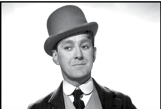
THE CARD , July 19, 22