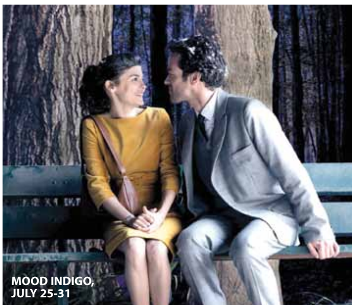
MOOD INDIGO, JULY 25-31