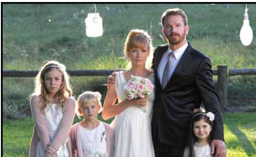
HONEYMOON, July 27, 30

A failing marriage and a son-in-law's resentment set the stage for the downfall of a national hero. Director Hřebejk deftly juggles intersecting storylines of infidelity and betrayal with a characteristic infusion of wry humor, as a distinguished doctor on the eve of being honored with a national award is revealed to be other than he seems. In Czech with English subtitles. DigiBeta video. (BS)