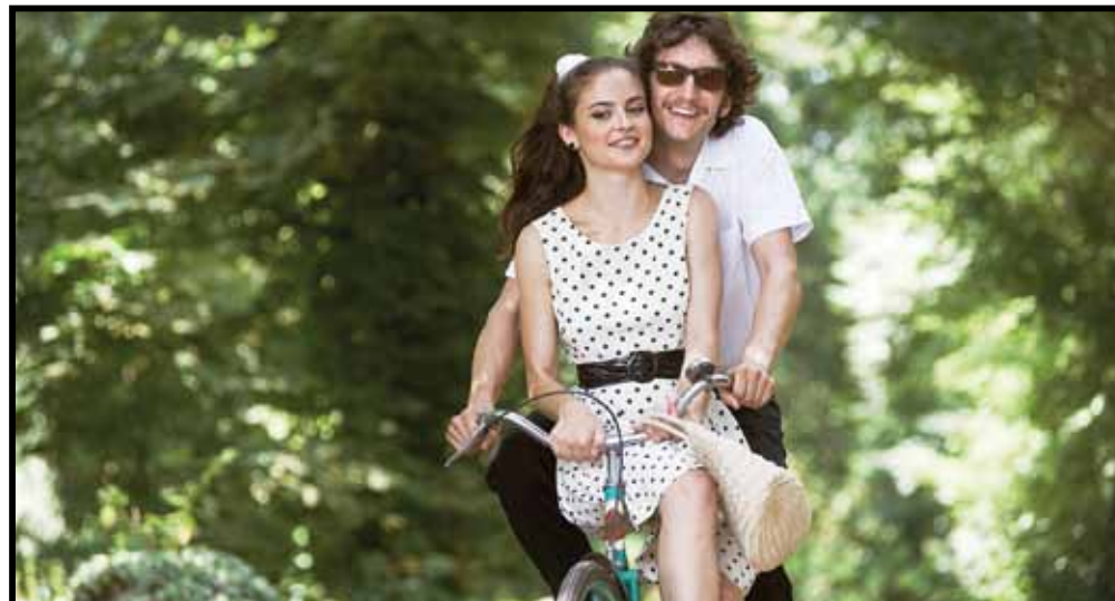
THE DON JUANS , July 20, 23