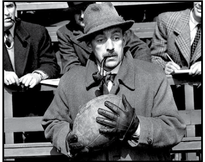
A RUN FOR YOUR MONEY, July 11, 12