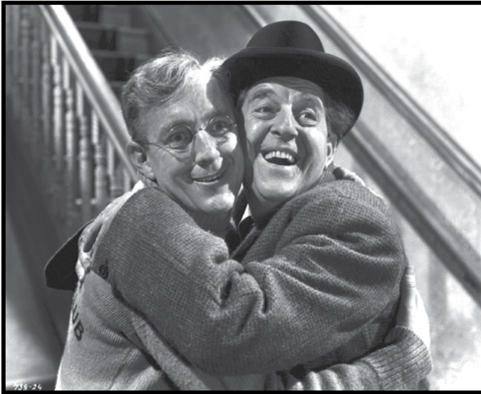
THE LAVENDER HILL MOB, July 5, 10