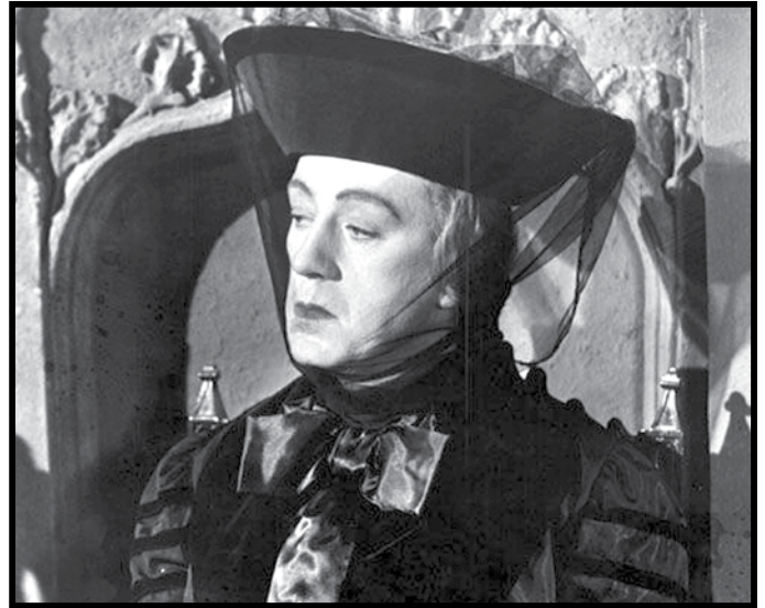
KIND HEARTS AND CORONETS, July 12, 17