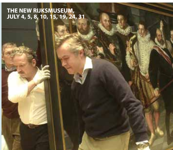
THE NEW RIJKSMUSEUM, JULY 4, 5, 8, 10, 15, 19, 24, 31