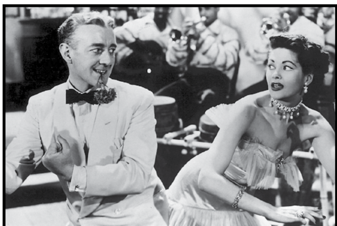
THE CAPTAIN'S PARADISE , July 26, 29