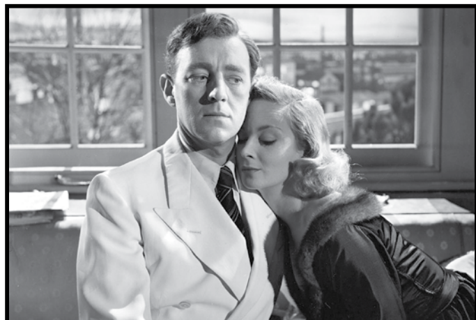
THE MAN IN THE WHITE SUIT , July 25, 26