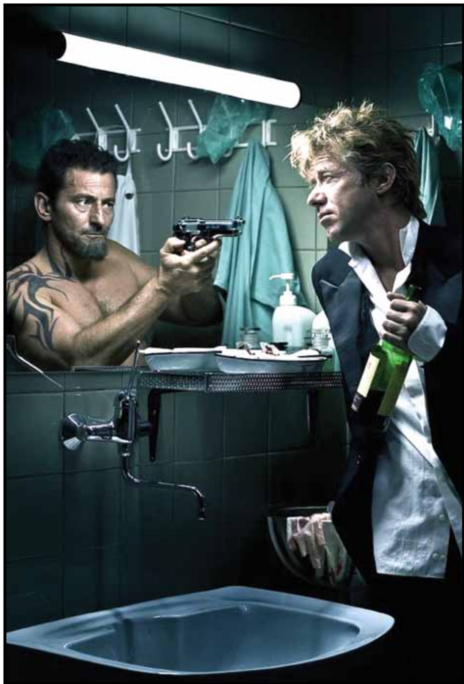
LOUSY BASTARDS, July 13, 14

A youthful fight over a girl sends two brothers on separate paths in this tragicomedy with one foot in the crime world. Urbane Miki becomes a successful but alcoholic neurosurgeon with a trail of broken hearts in his wake, while Afghan-war veteran Richard lives an isolated small-town life. As they revisit their long-dormant grudge match, can two wrongs make a right? Is there still time to make a whole of two halves? In Czech with English subtitles. DCP digital. (BS)