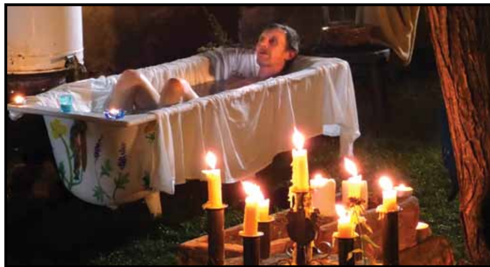
LIKE NEVER BEFORE , July 20, 21