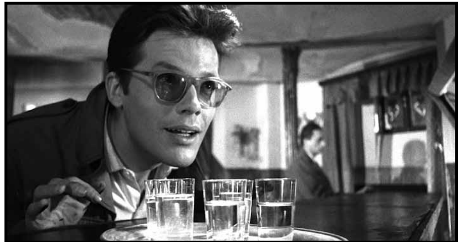
ASHES AND DIAMONDS, May 11, 14