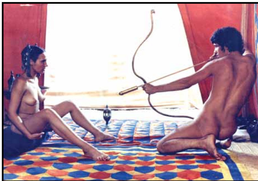
ARABIAN NIGHTS, May 2, 3