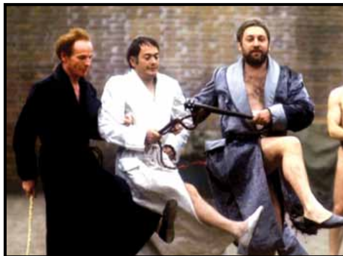
SALÒ, OR THE 120 DAYS OF SODOM, May 10, 15

Two mirroring stories revolve around the theme of consuming and being consumed. One is set in modern-day Germany, where Julian (Léaud), son of a former Nazi, prefers the charms of pigs to those of his fiancée. The second is set in a nameless desert during the Middle Ages, where a starving man (Clémenti) eats everything in his path. In Italian with English subtitles. 35mm. (BS)