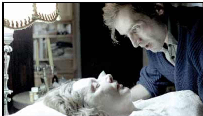
THE CONSTANT FACTOR, June 1, 2

Winner of the Jury Prize at Cannes, this uncompromising critique of idealism centers on a young electrician who yearns for the purity of mathematics and the remote Himalayan peaks where his father, a noted mountain-climber, died. Instead, he finds himself coming unstuck in a world filled with petty corruption, confusion, disease, and injustice. In Polish with English subtitles. DCP digital. (MR)