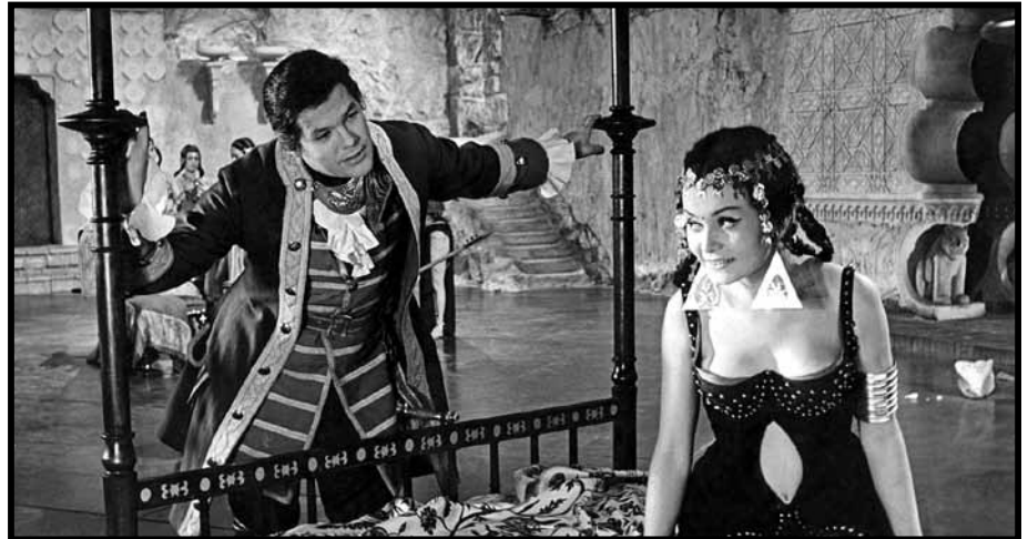
THE SARAGOSSA MANUSCRIPT, May 4, 5

Poland's greatest cult film stars its greatest cult actor (Cybulski) as a Napoleonic officer who takes refuge in a Spanish inn. There he becomes entranced by a magical manuscript that draws him into a labyrinth of dreams-within-dreams and tales-within-tales, involving priests, sheiks, demons, Gypsies, and beautiful Arabian princesses. In Polish with English subtitles. DCP digital. Note: There will be a ten-minute intermission. (MR)