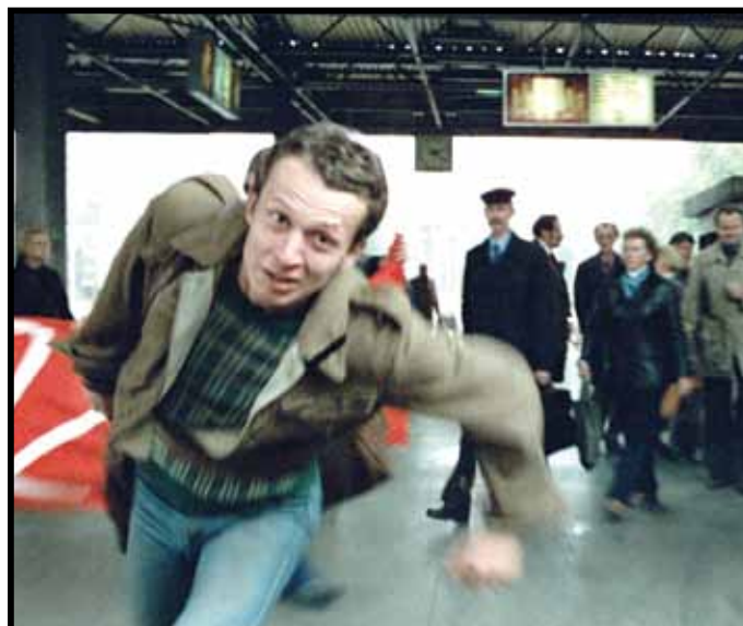
BLIND CHANCE, May 18, 22