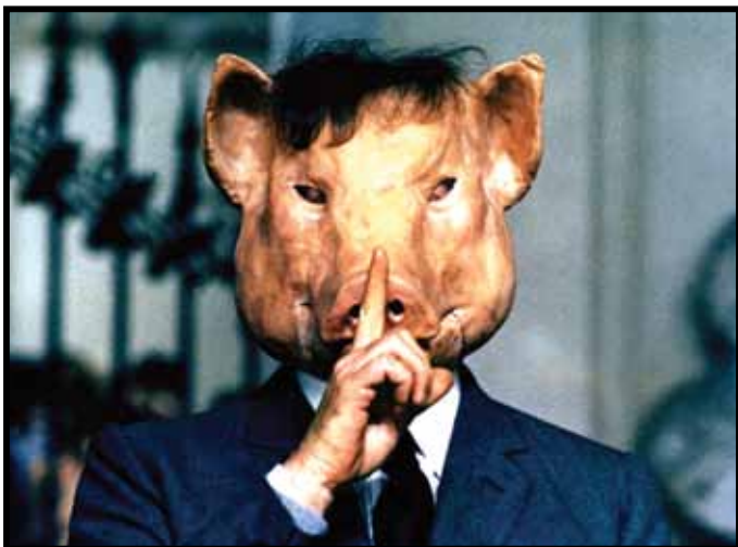
PIGSTY, May 10