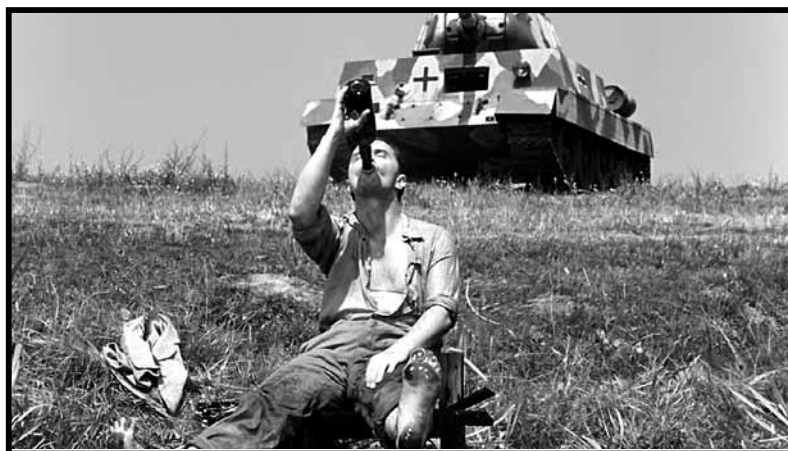
EROICA, May 25, 28

Directed by one of Polish cinema's foremost satirists, EROICA's two contrasting episodes are united by their irreverent attitude toward the Warsaw Uprising of 1944. The first follows a cynical hedonist who becomes caught up in the resistance; the second is set in a prison camp where demoralized POWs cling to a dubious legend of heroism. In Polish with English subtitles. DCP digital. (MR)