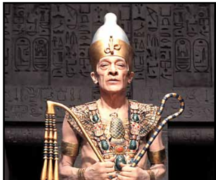
PHARAOH, May 25, 29