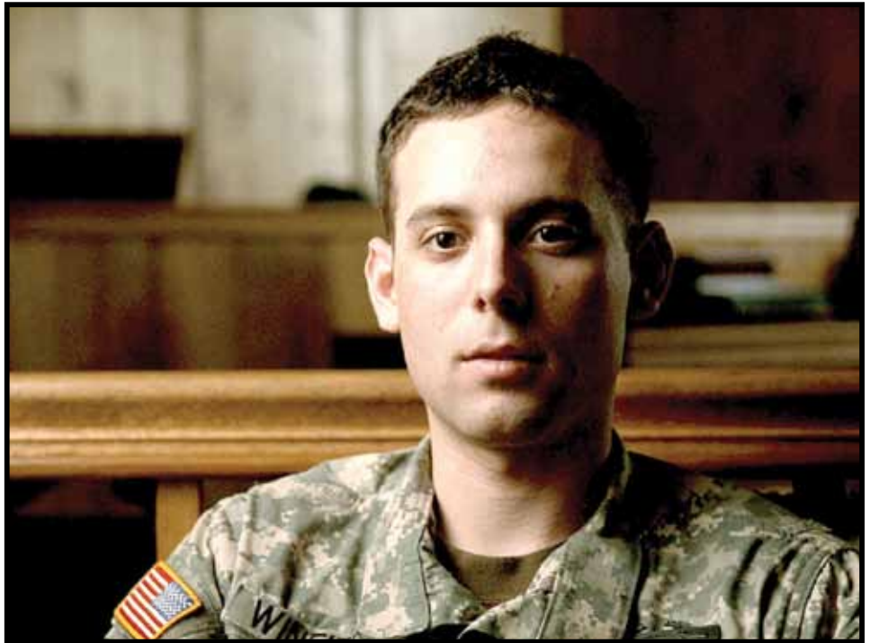
THE KILL TEAM, May 13