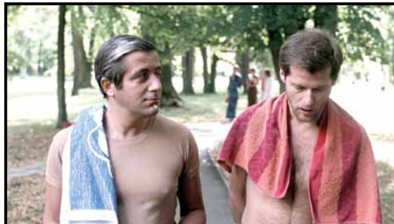
CAMOUFLAGE, June 1, 4

With a background in physics, Zanussi brought a uniquely observant and analytical sensibility to Polish cinema. Set at a linguistics seminar, this dark comedy centers on Jarek, an idealistic junior faculty member, and Jakub, a Machiavellian professor who attaches himself to the younger man—perhaps to mentor him, perhaps to destroy him. In Polish with English subtitles. DCP digital. (MR)