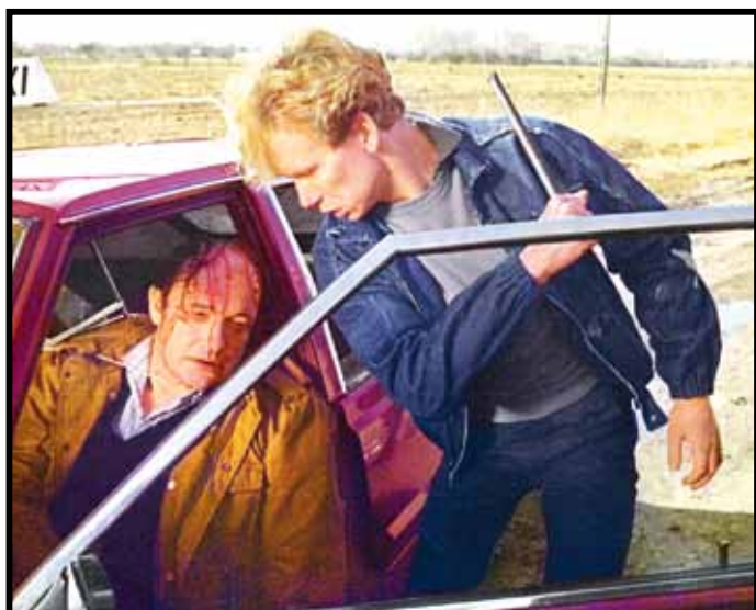
A SHORT FILM ABOUT KILLING, May 18, 19