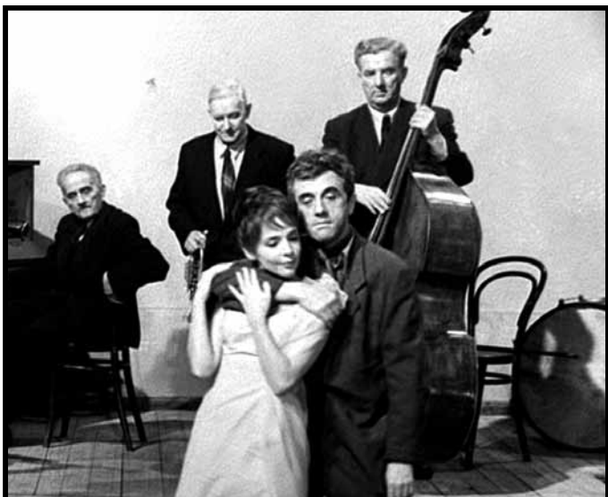
JUMP, May 11, 12